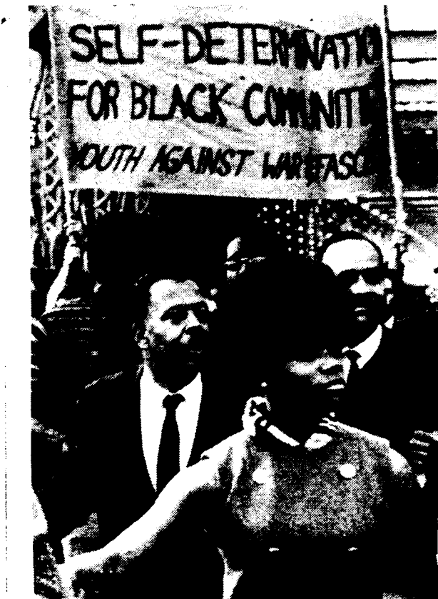
One side of the CIA-controlled race war.