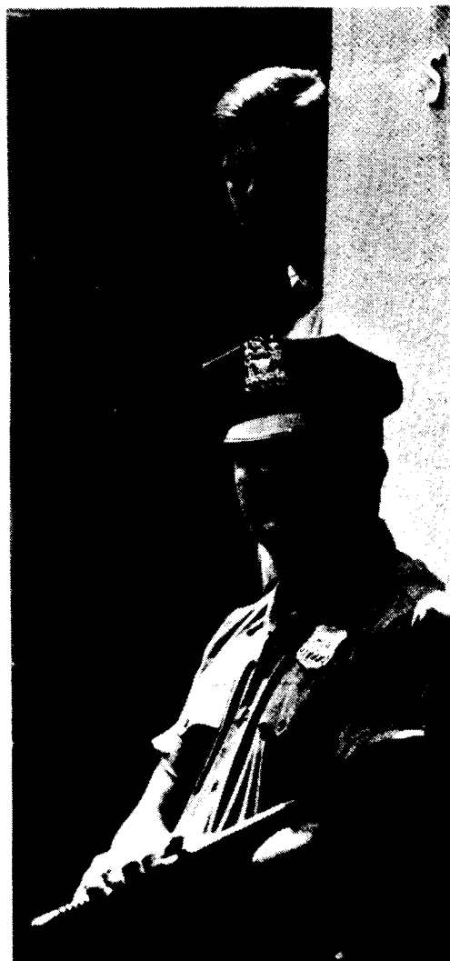
The Southern Cop: Tool of the LEAA

In post-election interviews, Jackson responded to