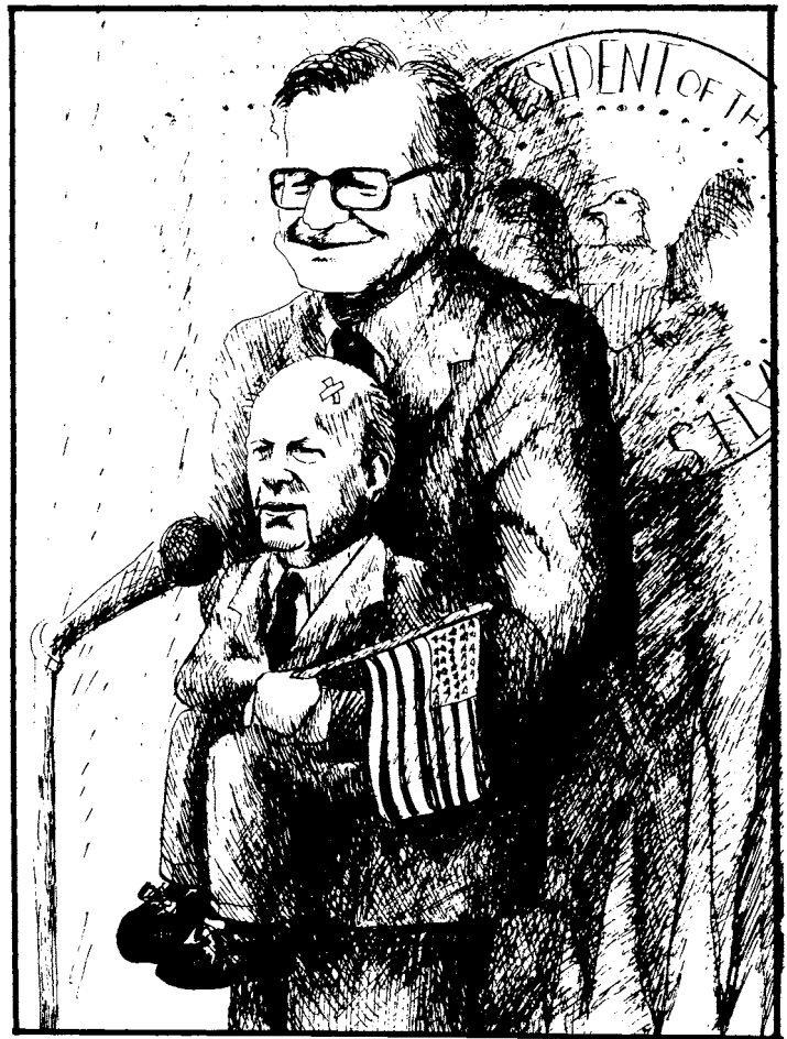
"The Role of the Vice President Depends on the President" Nelson Rockefeller, New York Times , Aug. 20, 1974

Significantly, French coverage of the Rockefeller nomination by Le Nouveau Journal pointedly referred to resistance to the move from certain sections of the U.S. working class. As a result of Nelson's Newport caper, the word was out immediately in Boston and Hartford, not to mention on the major national networks: the USLP is the rallying point for resistance to Rockefeller. In both Charlotte and Chicago, talk-show moderators are desperately searching for pro-Rockefeller spokesmen willing to debate the USLP. TV and radio stations in Baltimore and Seattle have sought out the Labor Party. One radio announcer told us that 90 per cent of the callers to his show opposed Rockefeller, with a half-dozen of them citing the Labor Party analysis of the Rockefeller conspiracy. In Buffalo, a WGR-Radio representative took a USLP press release saying, "I've got to admit, you weren't far off."