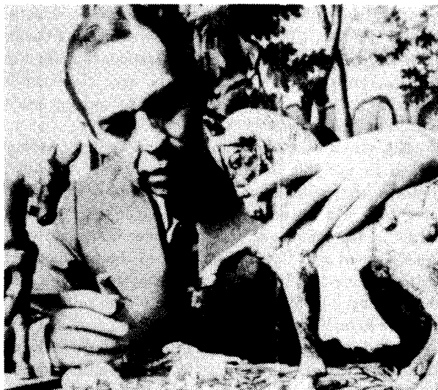
Alvaro Gomez Hurtado

tro government into a mood for punishing those it deems responsible.