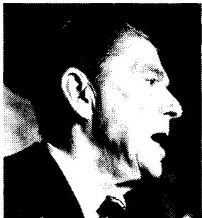
GAME 4: "The 'Who's Flirting With Ronald Now?' game, writing off the Democratic Party"