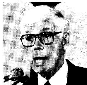
GAME 1: "The Anderson or 'Constitutional Crisis' scenario is the most dangerous game in town"

Furthermore, Muskie and Mondale are nearly as discredited as Carter abroad and have broken too many promises to constituencies in the United States to go very far.