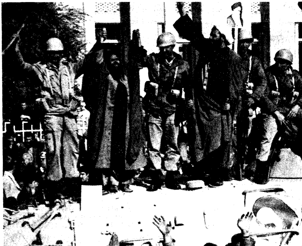
Iranian mullahs and soldiers hail the Islamic Revolution from the top of an armored personnel carrier. The "Islamintern" which maintains Khomeini in power is a Nazi-Communist entity, and many of Khomeini's close associates were trained in the U.S.S.R.

Before the formal founding of the Islamintern, Iranian terrorists had operational capabilities in the United States, Western Europe and the Middle East itself. Other capabilities are now being developed rapidly in Africa and Asia, through an upgrading of the Iranian diplomatic corps. This expansion under diplomatic cover is largely modeled on the Soviet diplomatic corps, which serves as cover for espionage and other activity well outside the bounds of protocol. Within the larger pool of Soviet agents in a given country, there is an inner core with assassination, or "wetwork," capability. But whereas the Soviets generally carry out assassinations in the West only in certain restricted areas (such as the elimination of defectors, and even then, agents of an allied state are usually used as intermediaries), the Iranians are not hampered by any such diplomatic niceties. When the Islamintern was established the Iranian foreign ministry arranged a purge of personnel deemed too diplomatic for the coming assignments.