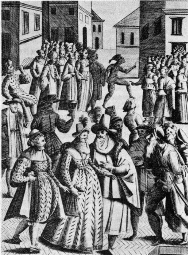
The Venetians are notorious for sallying forth, masked, to commit all sorts of obscenities in this disguise. "Carnival in Venice," an etching of c. 1610.

broadly than the Venetians in particular. Do any obscene thing you choose, during the week, as long as it causes no embarrassment to the family, and as long as you appear fully adorned in self-righteousness in the church's pew on Sunday—like Jimmy Carter, leaving an Allman Brothers' rock-concert orgy, to prepare the sickly self-righteousness he displays before his Sunday-School class. Many people do something of this sort, but murder and the darker obscenities, characteristic of the thoroughly powerful oligarch in the Venetian tradition, are not the stuff of ordinary wickedness.