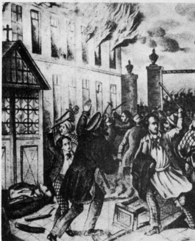
Mazzini's "Young Europe" set the continent in flames. Here: The revolution in Vienna, March 13, 1848.

The center of the development of Synarchism, was the