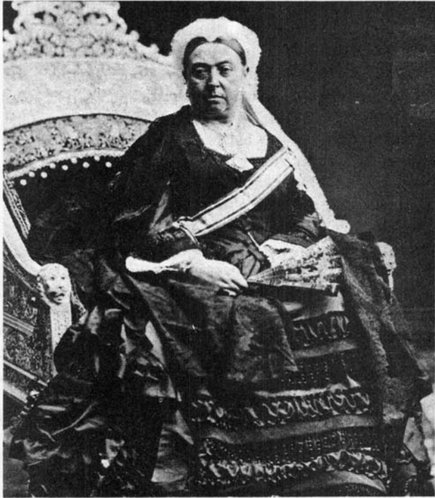
Britain's Queen Victoria: Her fecundity aided in incestuously fusing the royal families of Europe into a single, extended biological family, the Saxe-Coburg-Gotha.

In eighteenth- and nineteenth-century Europe, the political power behind the financial cartels was the feudalistic interest of powerful aristocratic families such as the Thurn und Taxis family. During the nineteenth century, the center of this aristocratic power, was the pan-European royal family of Saxe-Cobourg-Gotha. After the 1815 Treaty of Vienna, a sometimes murderous process was unleashed, to ensure that all of the royal families of Europe, and most of the other princely and ducal families, were all incestuously fused into a single, extended biological family, the extended family of Saxe-Cobourg-Gotha, a process much aided by the fecundity of one famous member of that family, Queen Victoria. Each of the branches of this family, and lesser-ranking families, is a financial corporation, modeled upon the Venetian fondo . The families' fondi each have the authority of a Roman pater familias over the members of the family, the power to disown or adopt heirs. The heirs do not control the corporation ( fondo ); they are the breeding-stock for the perpetuation of the fondo , the agents of the fondo 's interest.