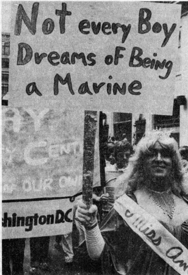
The "Aquarian Conspiracy," as seen in a New York City "gay rights" parade.

B.C., is the essence of the species of oriental mysticism on which all modern theosophy and "speculative freemasonry" are based.