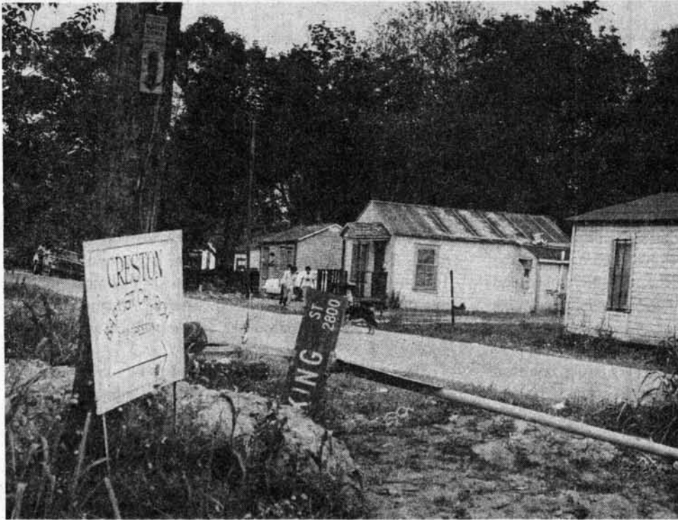
A shanty town in Texas: "If the administration admits that AIDS is roaring out of control among non-homosexual and non-drug-user victims along the states of the Atlantic and Caribbean coasts, the administration would be forced to admit that AIDS is being spread by deteriorating economic conditions."

the administration. The "Gay CLU" moved in, denouncing protests as a threat to the "civil rights" of AIDS carriers.