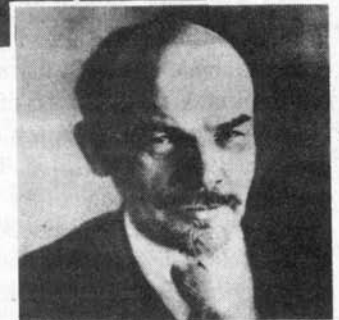
Some of the top figures of The Trust: clockwise from upper right, Alexander Helphand ("Parvus"), Fyodor Dostoevsky, V. I. Lenin, Bertrand Lord Russell, and Armand Hammer.

prior to 1917, and were represented as Trust partners of the Bolsheviks during the 1920s and 1930s.