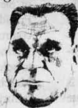
Marshal Nikolai Ogarkov