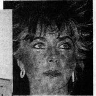
Proven wrong: Centers for Disease Control director James Mason, Surgeon General C. Everett Koop, the homosexual-rights lobby, and Elizabeth Taylor. But the nation still lacks a viable policy to stop this species-threatening disease.

mented reports, until now, of AIDS virus transmission to health care workers and family members, was easily explained. HIV, the virus which causes AIDS, is a slow incubation virus. Very high rates of transmission clearly occur in blood transfusions, sharing of hypodermic needles, and sexual contact. But, these "fast track" modes are atypical. Over time , slow-track modes of transmission—what the CDC refers to as casual transmission (anything other than sex or direct blood exchange)—would dominate.