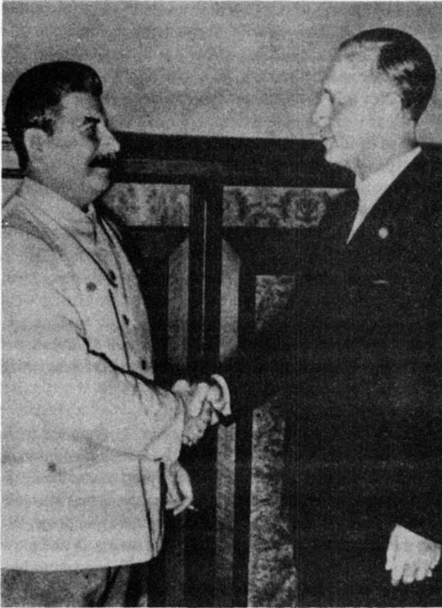
Handshake seals Russian-German pact of 1939, between Stalin and Hitler's Foreign Minister Ribbentrop. Stalin had begun to probe for an anti-Western pact with Hitler from about 1936, through "Trust" networks in Berlin.

ing those Red Army forces, catching them flat-footed, the Wehrmacht might have overrun Russia had Hitler not done Stalin the service of conducting the sieges of Moscow and Leningrad, thus forcing German forces into crippling attrition against the built-in defensive potential of the Soviet cities.