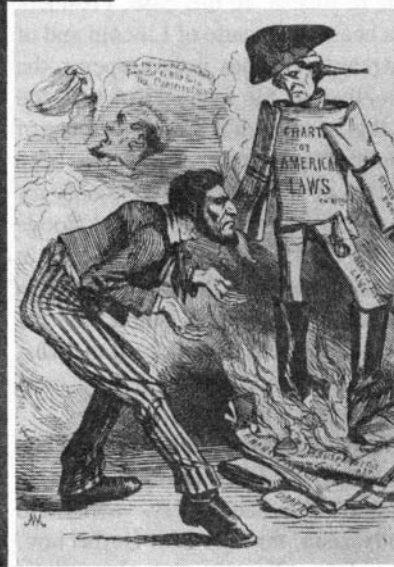
The Lincoln Memorial in Washington honors the man who not only saved his country but gave hope to all of humanity. Inset, British hatred of the great Civil War President is seen in this racist cartoon attacking Lincoln for signing the Emancipation Proclamation in 1863.

on this, and would recognize what Gorbachov is, and would look closely at the relationship between that disgusting British nanny, Prime Minister Margaret Thatcher, and the object of that nanny's obscene, middle-aged or mid-life crisis crush upon the rather ugly, monstrous, and thuggish Czar of All the Russias, Czar Mikhail Sergeyevich Gorbachov.