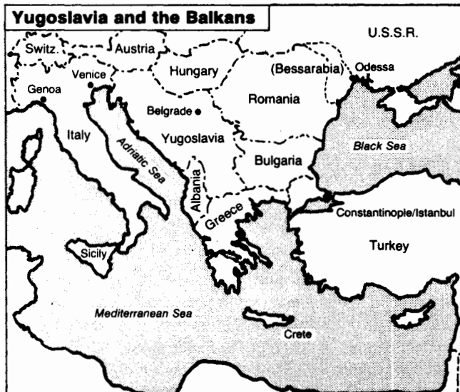
The area called the Balkans, from the Turkish word for "hilly, wooded place," today. Its history was determined by its strategic placement, between Venice, the Ottoman Empire with its capital in Istanbul, the Austro-Hungarian Empire, and Russia.