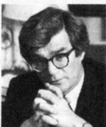
Sen. Rudy Boschwitz