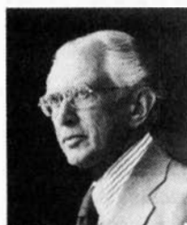
Sen. Howard Metzenbaum