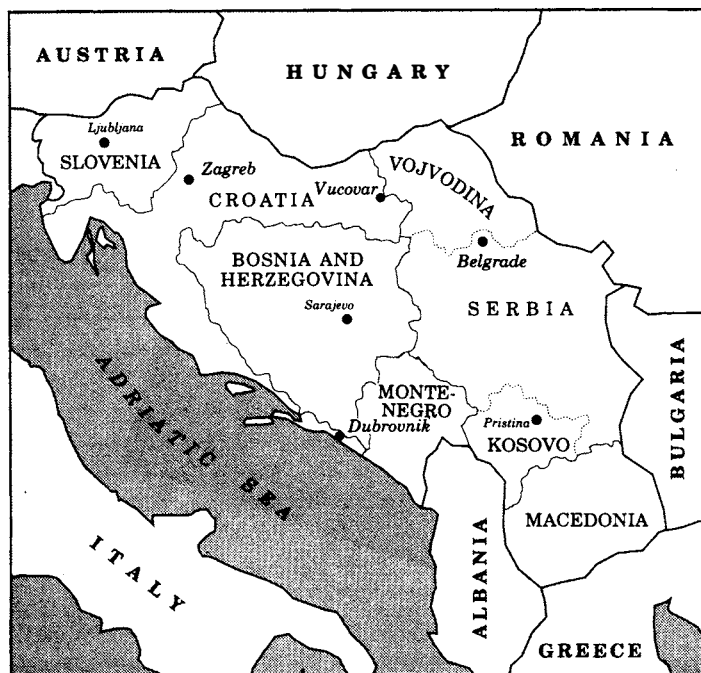
This map shows the six republics and two autonomous regions of the former Yugoslavia. Kosova, with a majority Albanian ethnic population, was one such autonomous region within the borders of Serbia, but it is now being illegally annexed by the Serbian regime. Macedonia is also threatened.

Considering the current situation, we are calling on the United Nations Security Council to convene an international conference on containing the Balkan conflict at the earliest possible date. The international conference would focus on realistic options for preventing the spread of Serbian "ethnic cleansing" and genocide to Kosova and Macedonia. To this end, we pledge our full cooperation and fervent support.