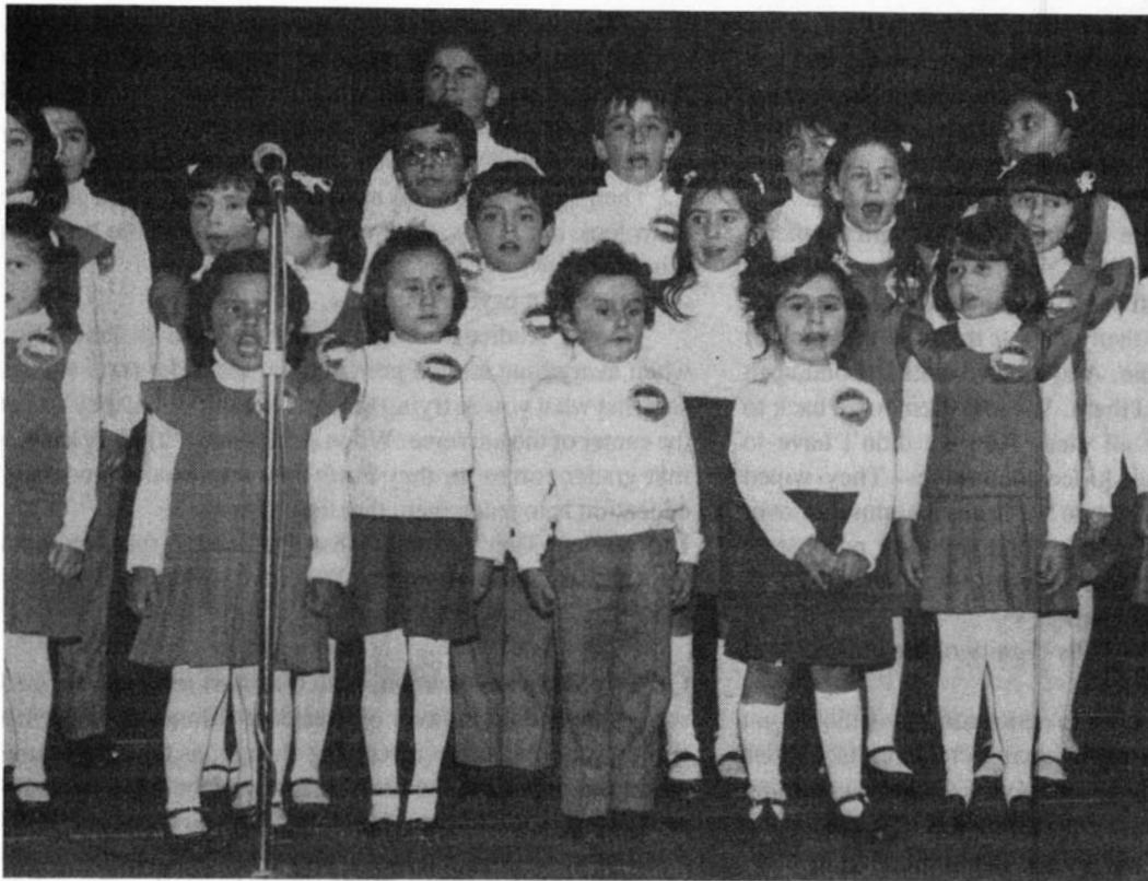
A children's chorus performs in Colombia. "The child is a process of development, not a fixed thing with fixed opinions. . . . The education of this imago Dei quality in the child is the essence of being human."

best terms to put it in: the question of God and the Becoming.