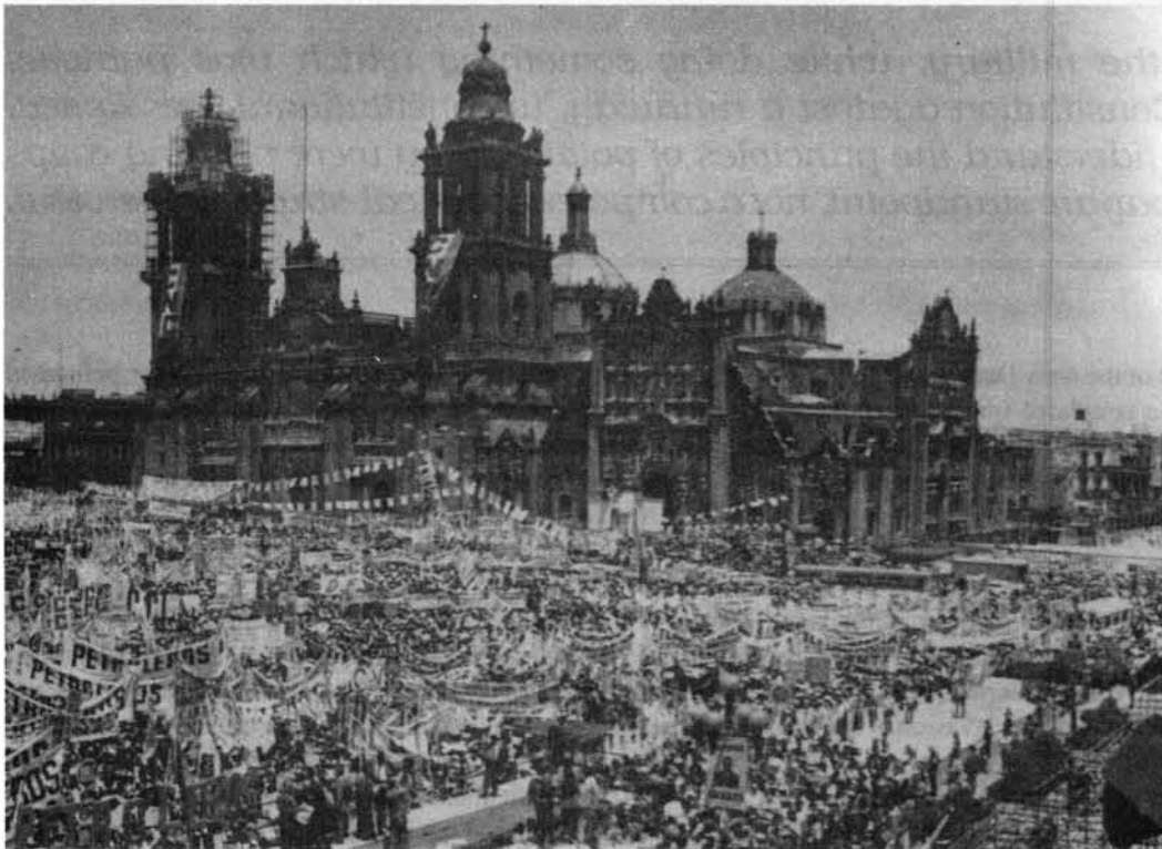
Mexico City's Zocalo, the central square, in September 1982, when President José López Portillo announced the nationalization of the banks. "We must have unity," says LaRouche. "We saw that in Mexico in 1982, when the Brazilian government and the Argentine junta capitulated. Mexico was destroyed and they were all put in the soup as a result of their failure to stand by Mexico."

has also been going on. So you've got a great Moloch in New York, who is sucking two things: jobs and businesses out of the United States and blood out of Mexico, along with a few other incidental commodities.