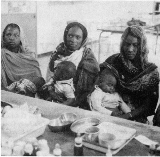
Mothers wait for medicine for their babies at the Social Center for mothers in Chad's capital, N'Djamena. With the breakdown of the French economy, France has taken to looting its former colonies, driving down living standards and creating the potential for social explosion.

performance of the economies of the zone. The French, who control the economy of the zone with about 80% of all investments, took advantage of the overvalued CFA franc and resisted World Bank and International Monetary Fund (IMF) pressures toward devaluation. French companies were in effect making enormous gains, because the overvalued CFA franc permitted them to indirectly grant subventions to French exports while at the same time increasing the value of their investments in the zone.