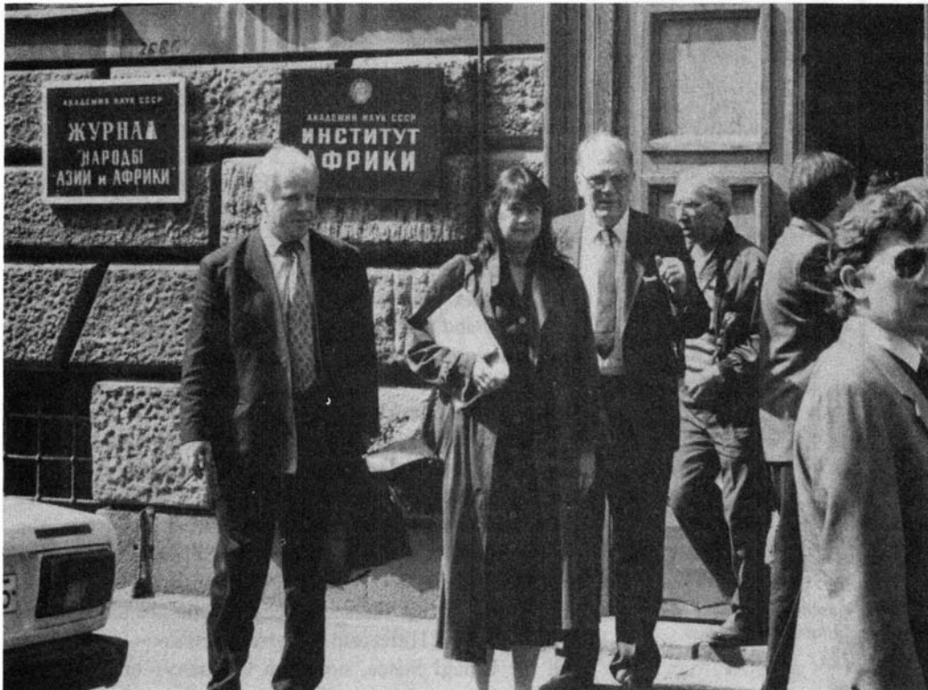
Lyndon LaRouche (center) and his wife, Schiller Institute founder Helga Zepp-LaRouche, emerge from a meeting at the Institute of Africa of the Russian Academy of Sciences in Moscow.

of Africa, especially sub-Saharan Africa, are manifold in nature, the primary feature of this, from the standpoint of policy, is that the worst expression of evil in the policymaking of nations is found demonstrated in sub-Saharan Africa.