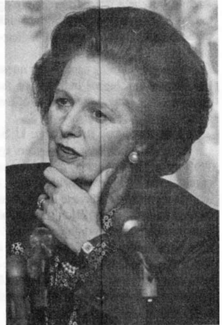
Leading figures in the Conservative Revolution (left to right): Ambrose Evans-Pritchard, Newt Gingrich, Margaret Thatcher. "The crowd which is trooping into Washington, herded by a bunch of scalawags known as the Heritage Foundation, would be called in Europe fascist. They're led nominally by the new 'Squeaker of the House,' a fellow by the name of Newt Gingrich."

highest levels of the U.S. government today.