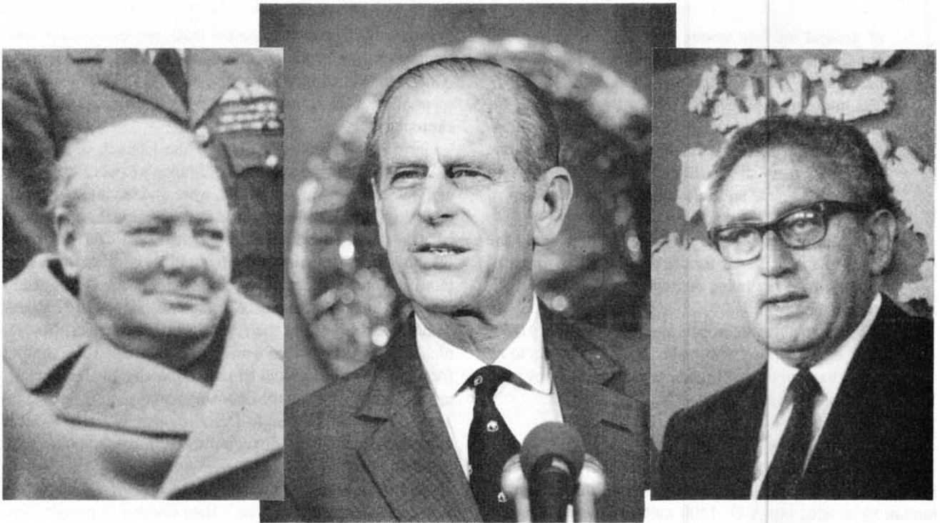
Left to right: Winston Churchill, Prince Philip, Henry Kissinger. Writes LaRouche: "An understanding of the evil motivations of British strategists, such as Kissinger, provides the reader with background indispensable for understanding the worldwide, new wave of international terrorism now spilling into the territory of the United States itself."

dents may be changed; but, the conflicting, vital, historically determined interests of the United States and the British monarchy have not changed, from our 1776-83 War of Independence, until today. Even after the 1901 assassination of President McKinley, the case of the U.S. Twentieth-Century military plan for winning a war against Britain, "War Plan Red," illustrates the point, 4 a threat of war, or virtual war between London and Washington, erupted at several points during the present century. The traditionally anti-American policy of Britain, as uttered by Kissinger back in 1982, is still, today, the basis for the new eruption of irregular warfare which one leading British imperial faction has been conducting openly against the United States since the close of 1994.