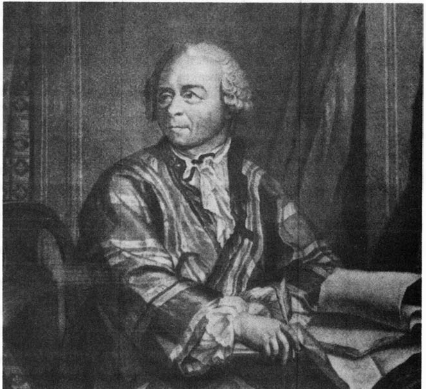
Bernhard Riemann (above) and Leonhard Euler (right). "Like Leibniz before him, Riemann's discovery demonstrates that formal mathematical-physics schemes do not embody the potentiality of a truth-doctrine. To find truth, we must depart the domain of mathematics, and go over into another domain, the realm of experimental physics."

discussion of mathematical series, whether or not mathematical discontinuities exist. 4 The relevant substantive issue behind these attacks on Leibniz by the Eighteenth-Century newtonians, Dr. Samuel Clarke and Leonhard Euler, is, much more today than during Riemann's time, whether physics is a branch of mathematics, or mathematics a branch of physics.