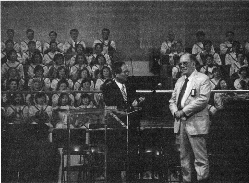
Lyndon LaRouche, campaigning in California on March 17, receives a warm welcome at the Los Angeles First Presbyterian Church, including the performance in Korean of Beethoven's "Ode to Joy," by full chorus and orchestra.

World War II veterans and their families. Some a tad older than I am; but that's us. We lived through the experience of the 1920s. We compare that, in our recollections today, with our experience of the United States of the 1930s, of the Great Depression. We experienced the mobilization for World War II. We saw this national economy transformed from a depressed junkheap, within about three years' time, into the greatest industrial power the world had ever seen, under conditions in which we had up to 17 million people in uniform, in military services.