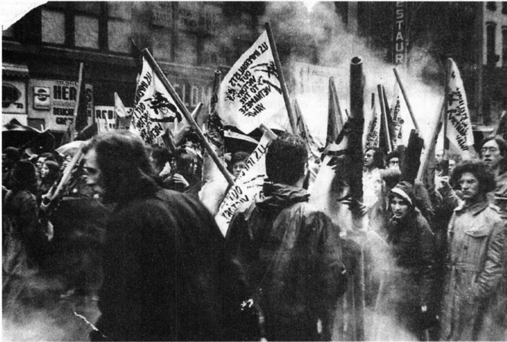
An early 1970s demonstration against the Vietnam War, by the Youth Against War and Fascism, one of the many radical, anti-war sectlets created for the baby-boomers, by think-tanks such as McGeorge Bundy's Ford Foundation.

abrogated. We went back to being a partner and a patsy of the British Empire. Americans returning, who had no competent national leadership, as they'd had under Roosevelt, who had not shown cowardice in warfare, showed cowardice in face of the threat of a new depression. And, the people with whom I'd served overseas, during the war, when I returned: "Don't say anything or associate with anyone who will get you into trouble, or jeopardize your economic security."