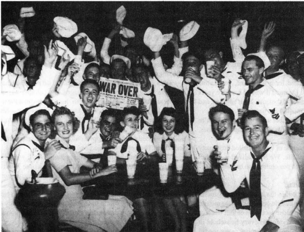
Victory celebrations in Norfolk, Virginia.. "We had people who were largely broken people, broken by the depression and by other conditions that existed in the country. And, whether in military service or in the economy, this half-broken people got up off the ground, under leadership, and built a mighty nation which had the power to shape, or to misshape the postwar world."

Roosevelt's program for South and Central America was