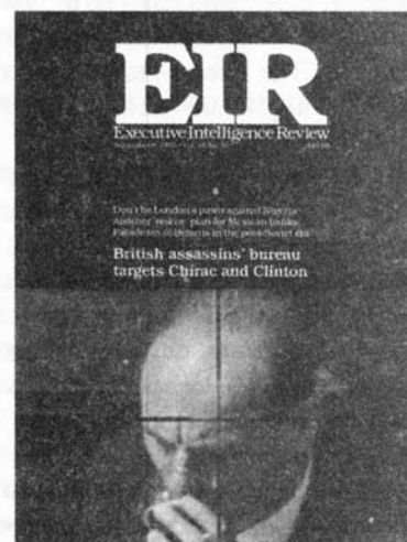
The British oligarchy moved in to block any such potential, delivering assassination threats against Chirac (shown on EIR's cover of Sept. 8, 1995). Chirac swiftly capitulated, and is now groveling at the feet of the British royal family.

He was taken for dinner to Buckingham Palace where, of course, British beef was featured on the menu. Chirac exulted about how happy he was to eat beef from the British cows that the French government had, only weeks earlier, demanded be slaughtered, after the British government officially admitted that “Mad Cow” disease could possibly be transferred to human beings. Chirac immediately authorized the French delegation to the European Union in Brussels, to push for easing the ban on British beef. Major thanked Chirac, for France’s action on this front.