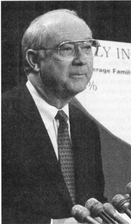
Left: Sen. Phil Gramm. His mass-murderous policies are those which Lyndon LaRouche warned, in 1966-71, would emerge from the fascist trends implicit at that time. Right: The 1971 debate between Professor Abba Lerner (at microphone) and LaRouche (with bow-tie). Since that time, no U.S. academic economist has been willing to risk his skin in a public debate with LaRouche.