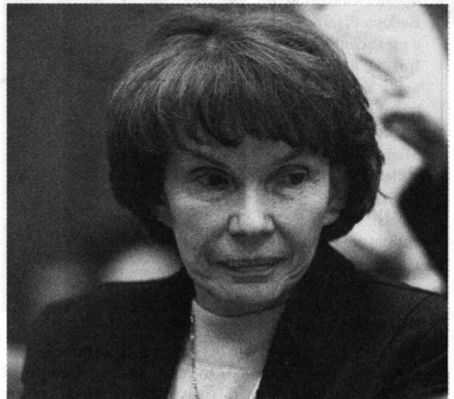
France's former First Lady Danielle Mitterrand, supporter of the terrorist insurgency.

The attacks have continued, both in the south, where the FARC has been deploying tens of thousands of coca-farmers for months on a violent rampage against the army's coca-eradication program, as well as in the north and northeast of the country. An Army patrol was ambushed and slaughtered in Northern Santander province, on the border with Venezuela, and a reported 12,000 terrorist-controlled peasants are on the march in that region of the country. Whole regions of the coun-