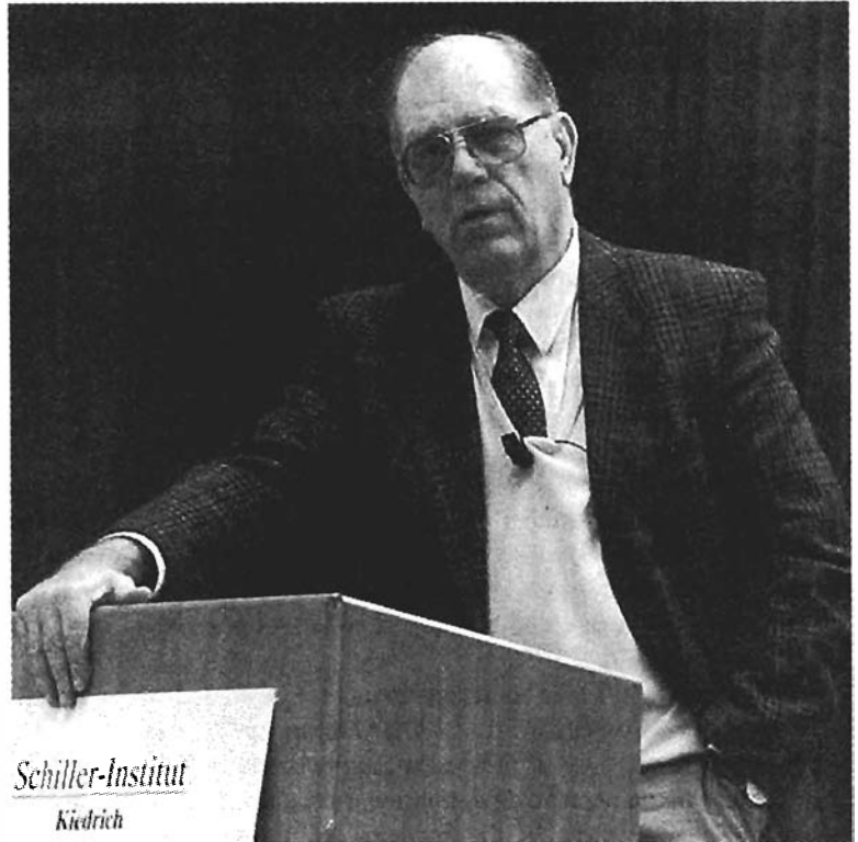
Helga and Lyndon LaRouche at the conference of the Schiller Institute and International Caucus of Labor Committees, in Kiedrich, Germany on Dec. 14, 1996.

sented with an opportunity to correct many of the errors which have made this world increasingly unsafe over the past 100 years, especially the past 30 years.