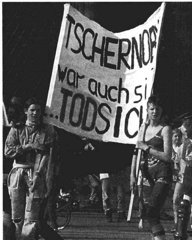
Anti-nuclear demonstrators in Wiesbaden, Germany, April 1996. The sign reads: "Chernobyl was also dead certain." The adolescent youth of Europe and America have been turned into freaks and even criminals, by the decline of family nurture resulting from the economic collapse, and by the terrible educational system.

In the United States, for example, as in Europe, the worst violence, the worst crime overall, is perpetrated by adolescent youth. The most dangerous criminal class in the United States