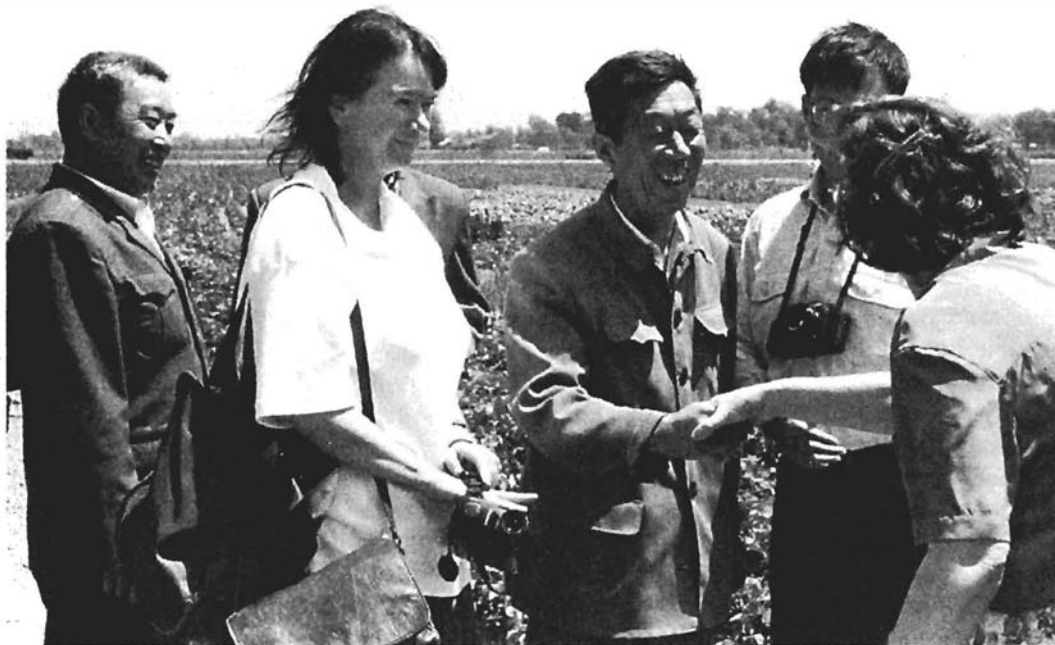
Helga Zepp-LaRouche (second from left) visits a farm in China, May 1996. With an ecumenical approach in matters of statecraft, we can transform the planet, in the interests of all nations.

Russian today faces, or the Ukrainian, or the Belarussian, or others, is to realize, that, in Russia's Twentieth-Century history, two Russian systems have collapsed. The old Tsarist system, and all its leading institutions, collapsed because they were too rotten to survive, morally rotten. The engagement of Russia, in alliance with France and Germany, the Entente Bestiale, to make war against Germany, committed Russia to its own self-destruction. And so, from 1905, 1907, until 1916, 1917, Russia, Tsarist Russia, walked with death. And, every leading institution of Tsarist Russia participated in the rotten, the guilt of doing that.