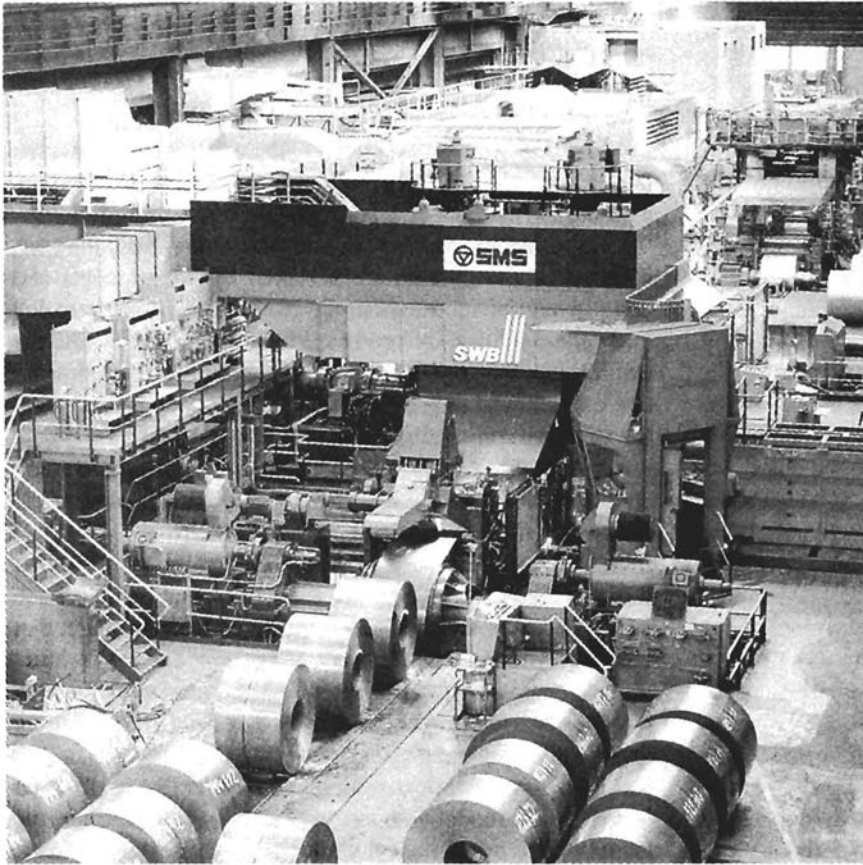
The steel works in Bochum, Germany. The Schloemann-Siemag company (SMS), maker of one of the machines shown in the picture, is an example of the kind of small and medium-sized company that composes the Mittelstand—a kind of conveyor belt from the scientific laboratory and university, into the practice of machine tool design.