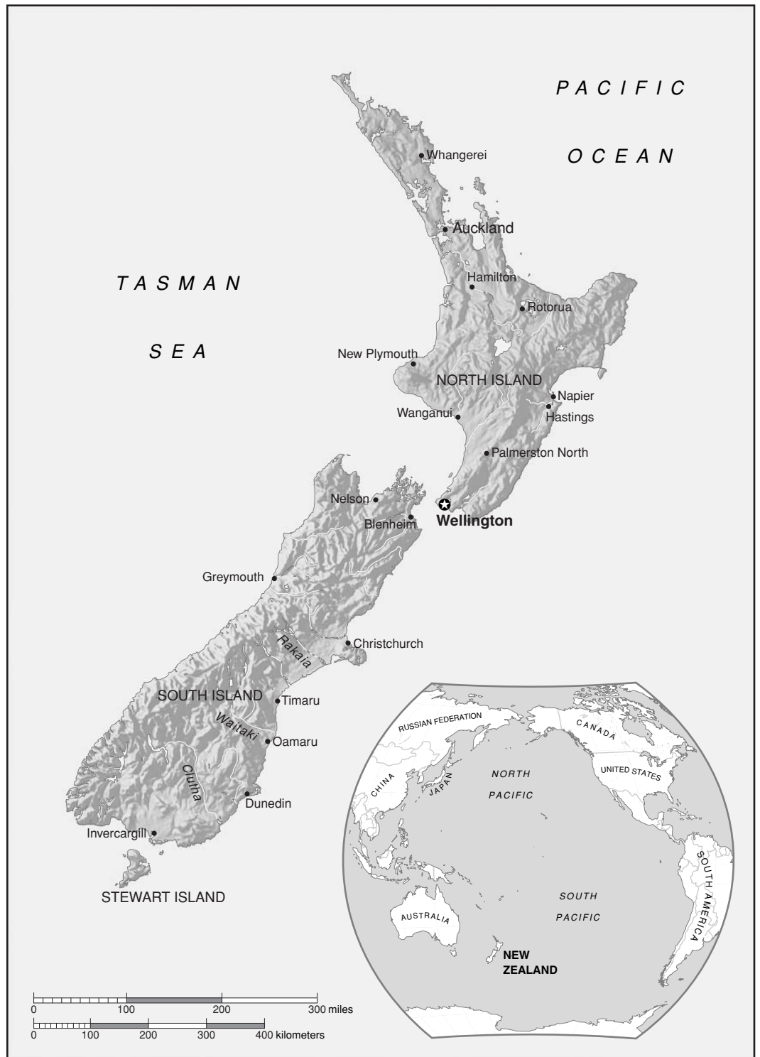
FIGURE 1 New Zealand