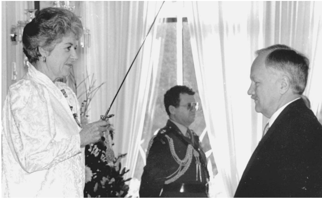
Roger Douglas, when he became New Zealand's finance minister in 1984, initiated the "reforms," known by the epithet "Rogernomics," which have destroyed the nation's economy. For this he was knighted by a representative of the queen.

projects such as steelmaking, electrified rail, and so on. Douglas's measures did such rapid, deep damage, that they earned his "reforms" the epithet "Rogernomics."