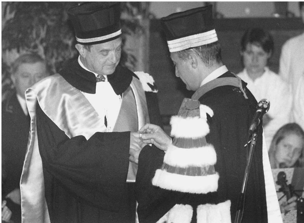
George Soros (left), Mr. Moneybags for the drug-legalization mafia and financial manager for Queen Elizabeth II, receives an honorary degree from Bologna University, October 1995.

the majority of members of the Victorian Royal Household spent their annual holidays at Balmoral Castle, looped on heroin and cocaine solutions. 1