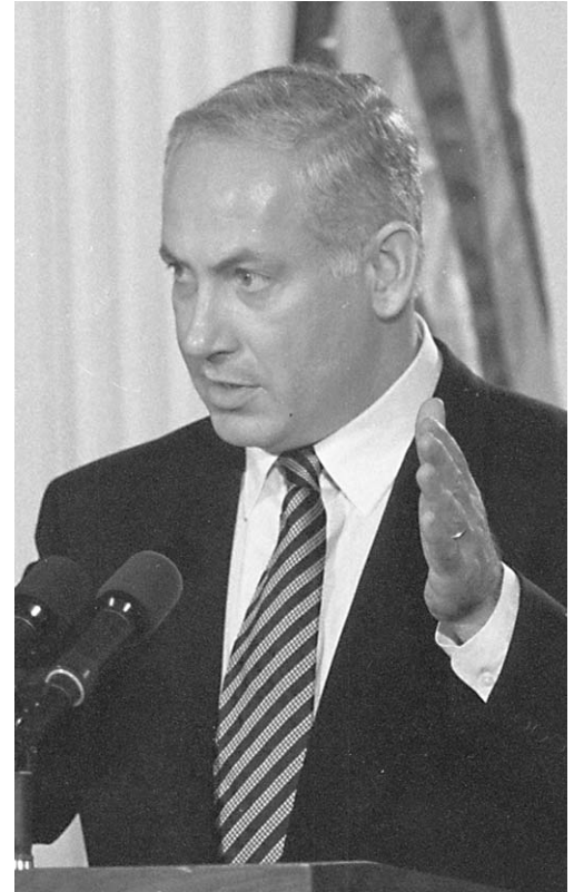
Israeli Prime Minister Benjamin Netanyahu (right) and U.S. Speaker of the House Newt Gingrich (above). White House spokesman Mike McCurry commented, with studied understatement, that Gingrich's provocative remarks in Israel show that "he has a ways to go when it comes to proficiency in diplomacy." In fact, the Speaker's statements have brought Israel and Palestine closer to a new explosion of violence, undermining the foreign policy of the U.S. government.

the Israeli Knesset (Parliament), Gingrich declared, "We in Congress stand with you today in recognizing Jerusalem as the united and eternal capital of Israel." While this is a sentiment held by many Israelis, the notion of a "united Jerusalem" including occupied East Jerusalem, which is considered illegal by the United Nations, is one of the most sensitive issues in the peace process. In comments following his speech, Gingrich accused the Palestinian Authority of "inciting violence" and of "suggesting violence," which, he said, is responsible for the deadlock. He also backed Netanyahu's bogus demands for "peace with security," saying, "Israel alone must determine its security needs. We cannot allow non-Israelis to substitute their judgment for the generals who Israel has trusted with its security."