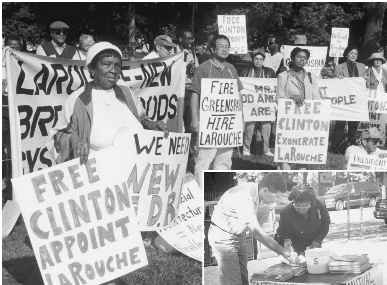
Rally to Save the Presidency sponsored by Schiller Institute in Lafayette Park, across the street from the White House, on Oct. 17.

All around the world, political activists are circulating an "Appeal to President Clinton," urging him to appoint Lyndon LaRouche as an economic adviser to his administration. On Oct. 17, the Schiller Institute held a rally of several hundred people across the street from the White House, mobilizing support for the President and calling for him to appoint LaRouche. Then on Oct. 20, the second International Day of Action took place (the first was on Oct. 13), with mass demonstrations, meetings, and actions by small groups or individuals to organize support for this initiative. In the United States, thousands of signatures were gathered on the petition to Clinton, at rallies in a dozen cities.