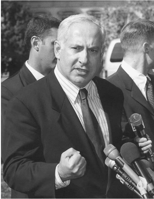
Unless the insane policies of Israeli Prime Minister Benjamin Netanyahu (left) and his new Foreign Minister, Ariel Sharon, are stopped very soon, the Oslo peace accords, and the intensive efforts by President Clinton to bring the settlement to fruition, will be totally destroyed, and a new war will be on the horizon.