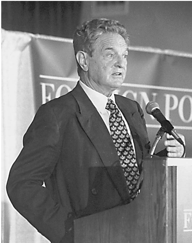
George Soros promoting his book on Oct. 5, 1998, at the invitation of Foreign Policy magazine and Public Affairs publishers. While giving the appearance that he favors real reform, Soros is proposing to intensify the looting of the genocidal IMF system.

not work. LaRouche has shown in his Triple Curve Collapse Function ( Figure 1 ), the actual state of the world economy and financial system. The upper curve represents the financial aggregate, the mass of speculative instruments, such as the current $165 trillion world total of derivatives holdings, the inflated tens of trillions of dollars valuation of the world's stock markets, and so on. Since the early 1990s, this curve has been growing at a hyperbolic rate. The middle curve represents the monetary aggregate, which is best identified as the money supply. This has been growing at a rapid rate, though not as fast as the upper curve, in order to liquefy the financial aggregate and prevent it from collapsing the system. The lower curve represents the output of the physical economy, which supports human existence. This is contracting, and, as the rate of return and financial claims of the upper two curves increases, they suck wealth out of the lower curve, increasing its rate of contraction.