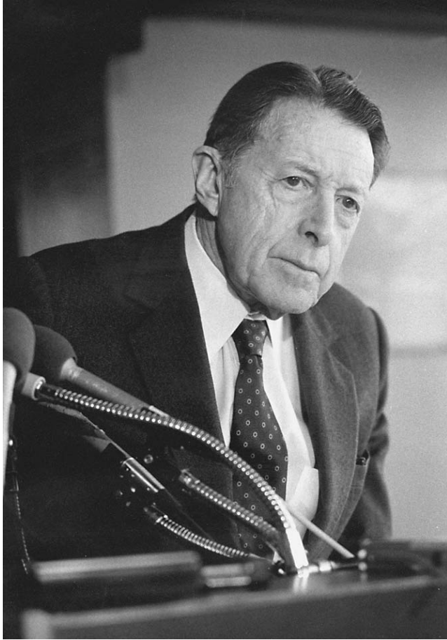
Sir Caspar Weinberger promotes his scenario book The Next War , which gives a vivid idea of what his faction of the oligarchy has in store for the world.

modelling their narrative on Pentagon computerized war simulations.