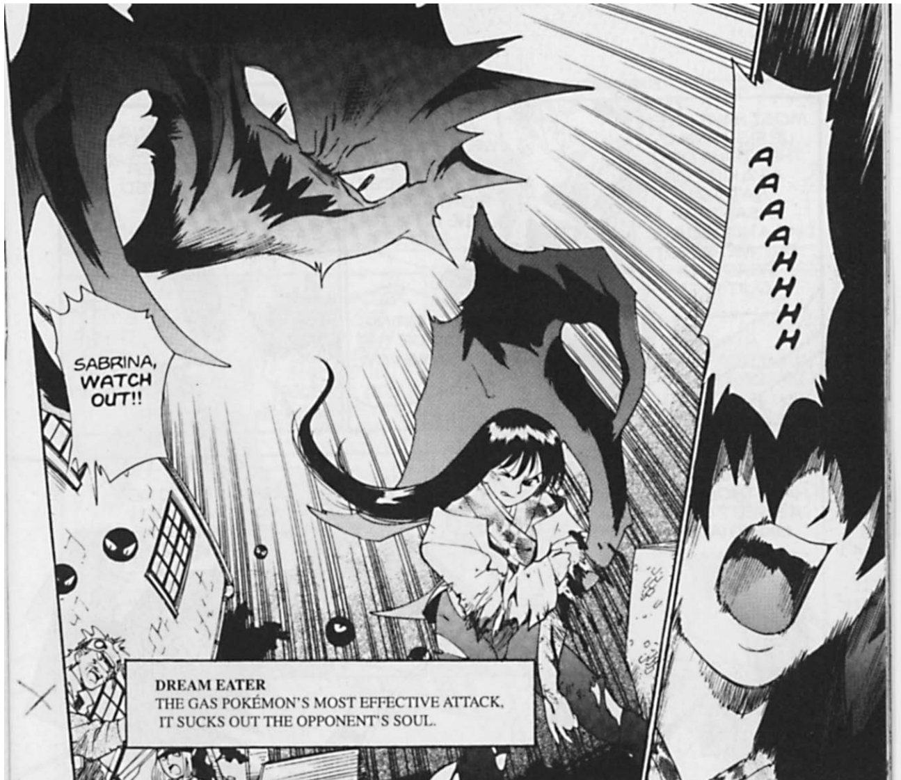
A scene from the comic book "Pokémon: The Electric Tale of Pikachu."