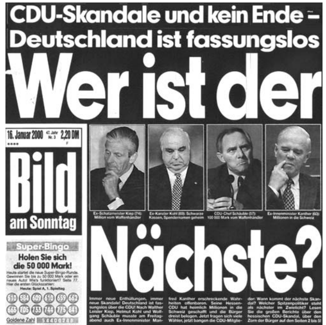
The destruction of Germany's political institutions is conveyed in this headline from the weekly Bild am Sonntag: "Who's Next?" Shown are Christian Democratic Union leaders (left to right) former CDU Treasurer Walther Leisler Kiep, former Chancellor Helmut Kohl, former CDU Chairman Wolfgang Schäuble, and former Interior Minister Manfred Kanther.

Now, I have stated elsewhere, and I will not do that at this point, that the context of this present dismantling of the political institutions in Germany was the geopolitical decisions around German reunification in 1989-90, the Gulf War, the imposition of the European Monetary Union, and the elimination of the German mark. But now, I just want to identify this context here. I want to basically talk about the method of