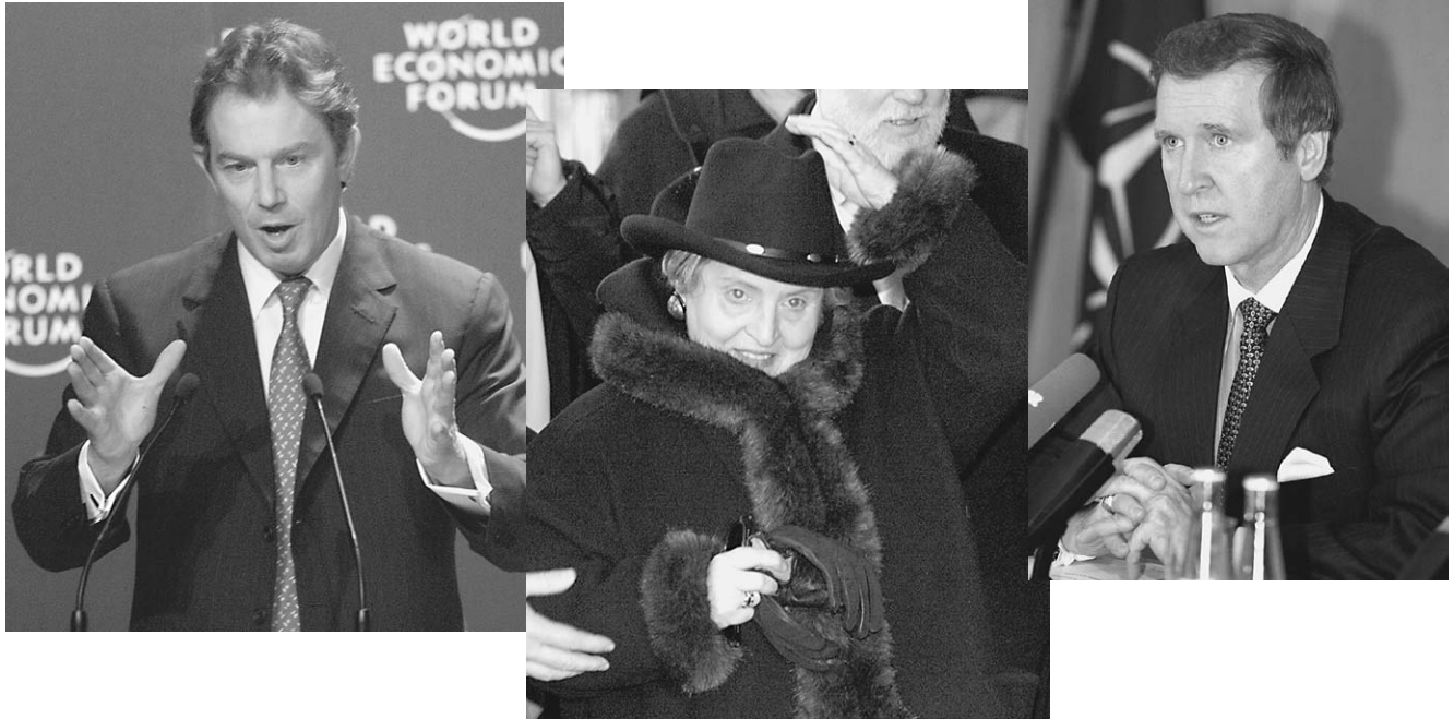
The British-American-Commonwealth oligarchy is using wars around the world, to try to maintain their power in the context of the ongoing financial-economic breakdown. Left to right: British Prime Minister Tony Blair, U.S. Secretary of State Madeleine Albright, U.S. Secretary of Defense William Cohen.