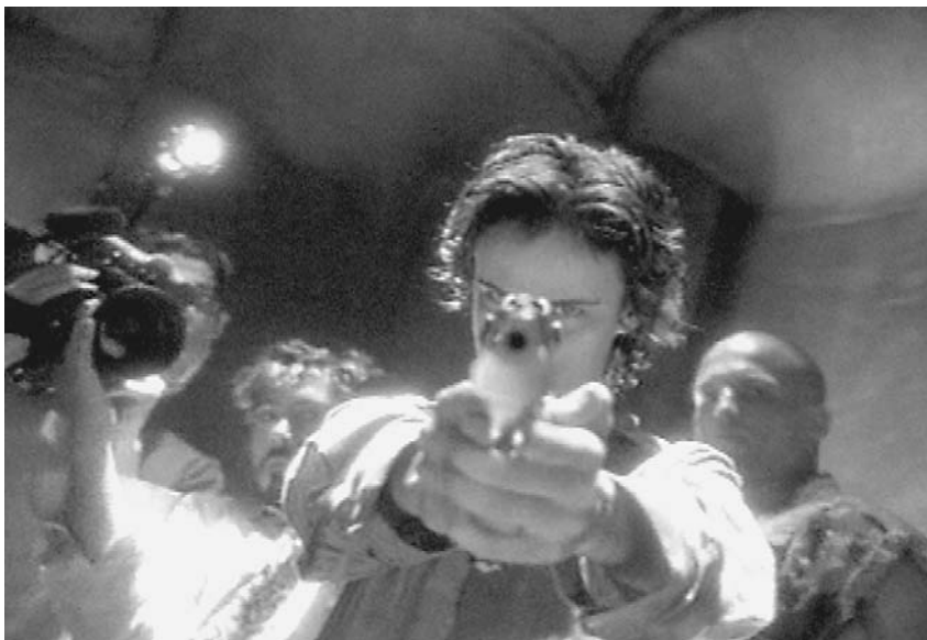
"Natural Born Killer"