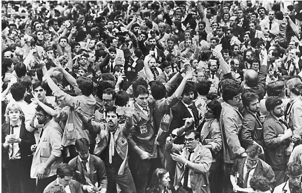
The old captains of American industry were replaced by managers, the CEOs, as speculation took the place of real production. Here: speculation mania at the Chicago Board of Trade.

their published and spoken opinions conform with what they thought was the opinion of the organization they worked for. So they became mouthpieces, rather than truth-seeking people. Perhaps the intellectuals were always drawn into the orbit of the ruling class, but there, in the middle of the twentieth century, the recoil from detachment and the falling into line, seems more organized, more solidly rooted, in the centralization of power. Intellectuals became helpless in a fundamental sense, that they felt that they could not control what they were able to foresee. Naturally, such frustrations only would arise in those who had a feeling, a compulsion, to act, because the detached spectator would not even feel his helplessness, because he never tried to surmount it.