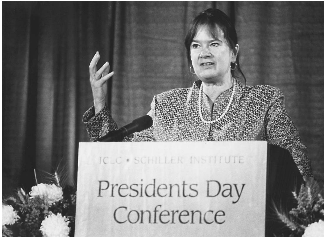
Helga Zepp-LaRouche addresses the semi-annual conference of the Schiller Institute and International Caucus of Labor Committees, Feb. 20.

And, in the same way, many people are seeing aspects of the crisis as it affects them.