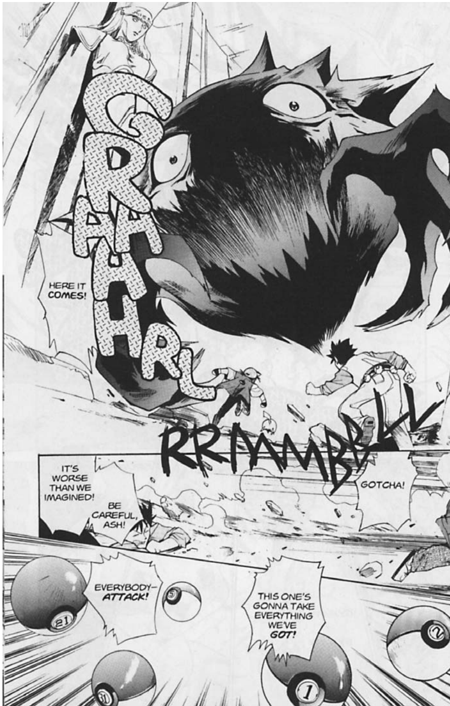
A scene from the comic book “Pokémon: The Electric Tale of Pikachu.”

of children up from the level of three years old.