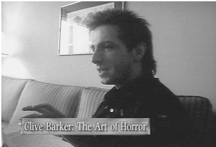
"Clive Barker: The Art of Horror."

Rock music. Laughter. Gunshots. "Greasy, f— pig! . . . You're less than a man. Are you clean? or are you