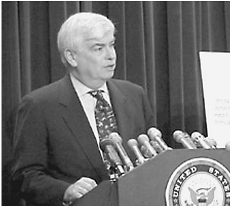
Sen. Chris Dodd (D-Conn.) at the March 3 press conference, to urge better oversight and more research of pre-schoolers taking prescription drugs.