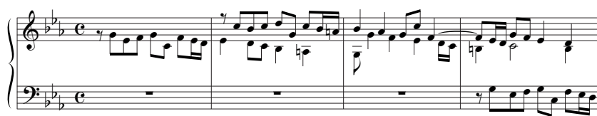
FIGURE 1 Opening of Fugue II from Part 2 of J.S. Bach's Well-Tempered Clavier

The Art of the Fugue is a cycle of fugues and canons, written on a single theme. As you know, a fugue is a polyphonic composition, in which the main theme is introduced repeatedly in all the