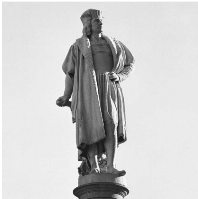
Christopher Columbus's exploration of the New World was directly inspired by the policies formulated by Cardinal Nicholas of Cusa.

The creation of the institution of the sovereign form of nation-state, and the establishment of the notion of a commu-