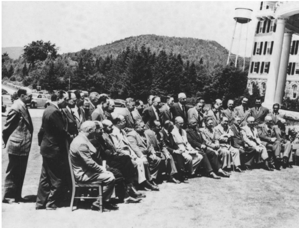
The Bretton Woods International Monetary Conference in 1944. "The principal fault with the 1945-1965 Bretton Woods System, was that Roosevelt's successors bowed to Churchill's and kindred demands for restoring colonialism, either in its customary form, or as what became ill-disguised neo-colonialism."