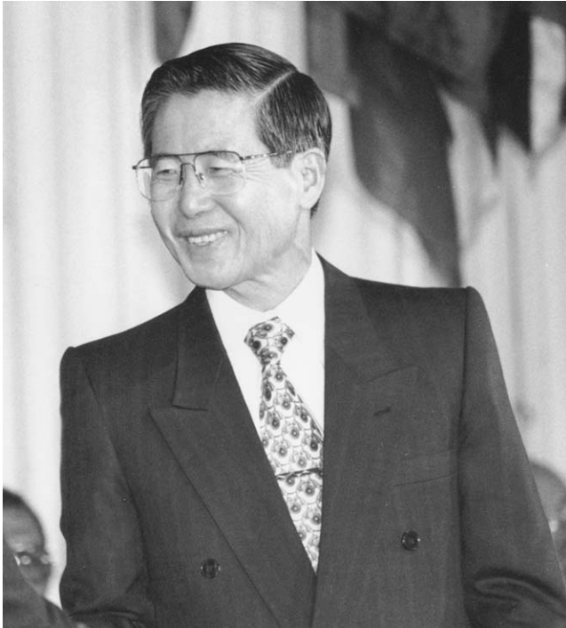
Former Peruvian President Alberto Fujimori was ousted by the Anglo-American oligarchy, in order to turn power over to the drug legalizers there.

selves, and to eventually link up with the nations of Asia against the hegemony of the international forces of globalization. Vicente Fox, who assumed the Presidency on Dec. 1, intends to be the leading promoter of a Latin American Free Trade Agreement, which would eliminate what remains of the national patrimony and sovereignty of the nations of the region.