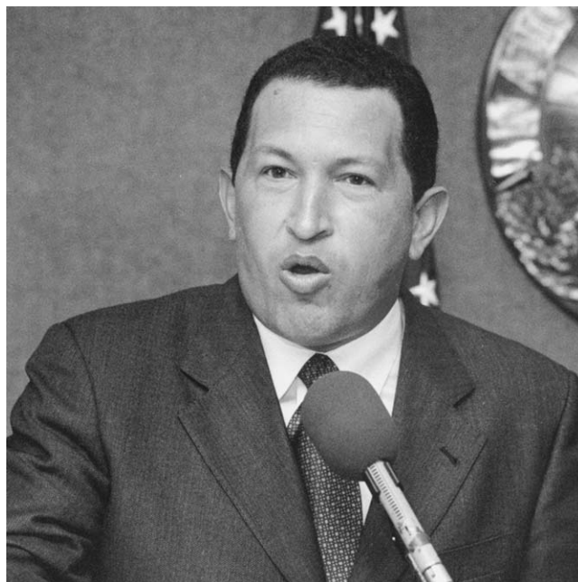
Venezuelan President Hugo Chávez's Jacobin revolution is based explicitly on the fascist slogan of the Roman Empire, " Vox Populi ," the irrational voice of the enraged masses.

The true face of vox populi is the unstoppable predatory force of desperate masses led only by their passions. For Raúl Reyes or Hugo Chávez, man is no different than the instinctive beast governed by such passions. They embody an absolutely bestial concept of man, a man without mind, without a soul, a decorticated man—the same degrading idea that the oligarchy has, and which views man as in no way superior to a trained ape, open to being manipulated and controlled; or that