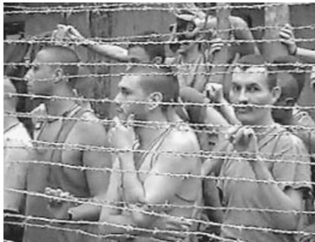
Prisoners held in concentration-camp conditions by the narco-terrorist FARC in Colombia.

Among what might be justly called "The Mindless Movement" rampant in more and more regions of Ibero-America