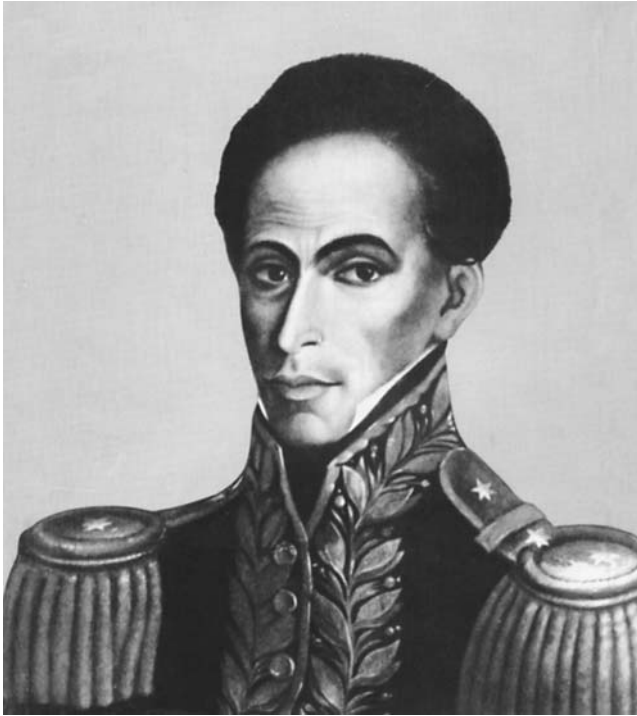
South American revolutionary leader Simón Bolívar (1783-1830) warned of the combination of subversion and external force, used by the British monarchy to destroy the nations of the continent.

subversion and external force, all directed chiefly by the relevant institutions of the British monarchy and its accomplices inside the United States and elsewhere. From this standpoint, the character and danger represented by today's "mindless movements" should become clear.