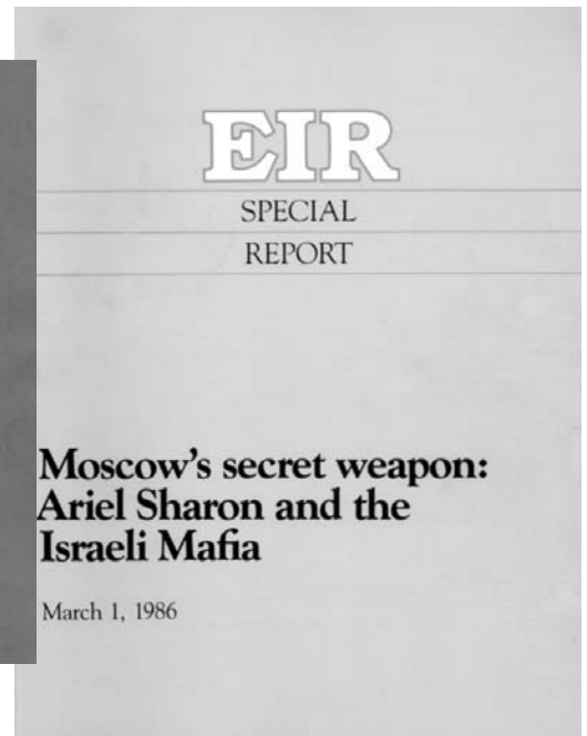
Friedman's book picks up on intelligence leads first spelled out in these EIR special reports from the 1980s.

gence and law-enforcement establishment, an estimated 10% of the 800,000 Russian Jews who now reside in Israel are "mobbed up." Furthermore, the Russian immigrant party, headed by Russian "refusnik" Natan Sharansky, is a virtual political front for the Red Mafia. One notorious Russian mafioso, Grigori Loutchansky, of the Latvia- and Austria-based Nordex firm, alone, put millions of dollars into Sharansky's political operations in Israel, and fed an estimated $1.5 million to Benjamin Netanyahu, for his 1996 election campaign for prime minister. Not surprisingly, as soon as he came into power, Netanyahu shut down the only Israeli government interagency task force tracking the Russian Mafia's operations inside the country.