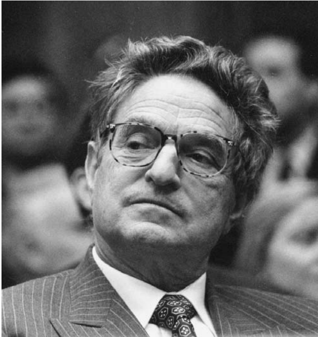
George Soros' financial empire is the funding source for many of the groups that are supposedly rioting against the policies of the oligarchy which he represents.

properties, so I actually went with him and we took possession of these large estates. That was my identity. So it's a strange, very strange life. I was 14 years old at the time."