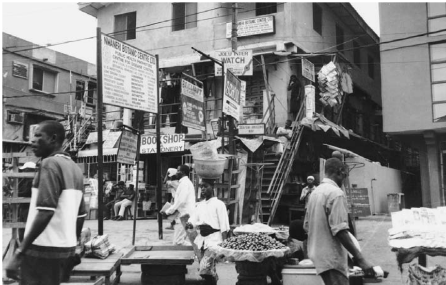
A street scene in Abuja, dominated by the “informal economic activity” which proliferates in Nigeria’s wrecked economic circumstances.

sisted. He urged the 175 in attendance to heed the presentation of Conscience International’s featured speaker—this writer—as “Mr. LaRouche’s number one disciple.” That presentation was “The Time Is Now, For a New Bretton Woods.”