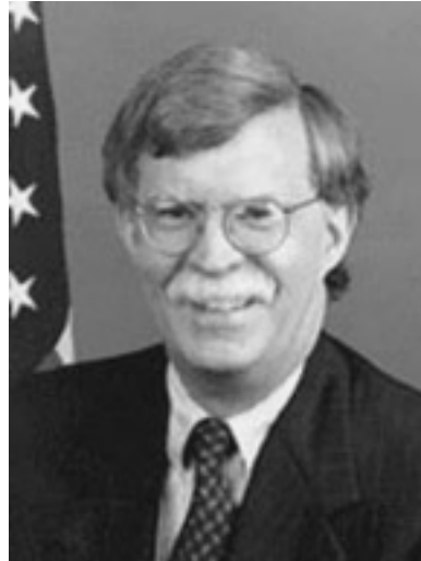
Asian stabilization moves were given greater urgency after U.S. State Department “chicken hawk” John Bolton went to Seoul on Aug. 28 to repeat the “axis of evil” charge and call for regime change in North Korea.

Koizumi’s trip to North Korea “was coordinated with Russia and China, who also gave North Korea very strong commitments for big money to rebuild the lines and their economy,” the Korean said. “For that reason I expect something concrete to happen within the next few months”