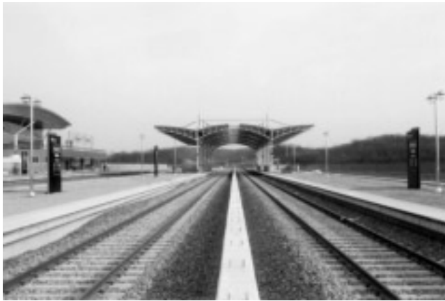
The new Dorasan station at the southern border of the DMZ, ready to connect the eastern line up the Korean Peninsula.