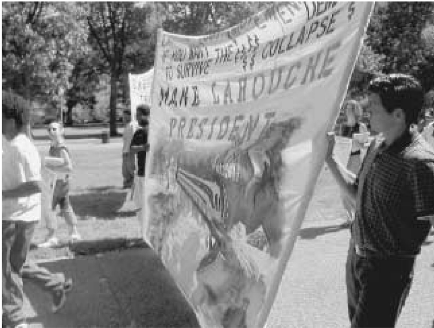
Another copy of the banner out in the streets of Washington, D.C., carried in a rally by LaRouche Youth Movement organizers in September.

point out to you, how degenerate our people have become; because the spread of cults—such as the cult represented by that lunatic who is Attorney General, and the lunatics of his own kind which he’s bringing into the Justice Department; the lunatics like the spread of the Moonies, taking over one part after another of leaders of organizations of different constituencies—could only be possible if there were a deep and spreading moral and intellectual degeneracy in the population in general.