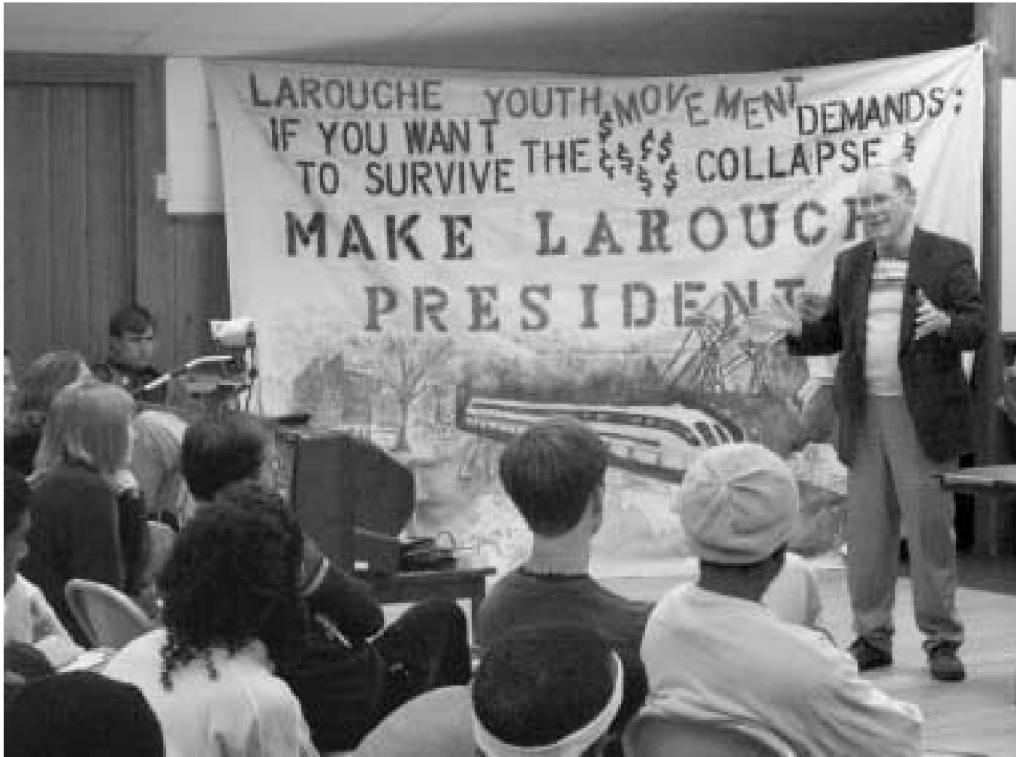
LaRouche walked among the group during his talk, for which Youth Movement organizers had made a banner which makes its purposes crystal clear.

agents: the Duke of Orléans, who was a British agent, and his accomplice, another British agent, Jacques Necker. And the two of them ran this operation. The purpose of the operation was to prevent the organization of a true Republic of the type that Bailly and Lafayette had attempted to establish as a constitutional Monarchy.