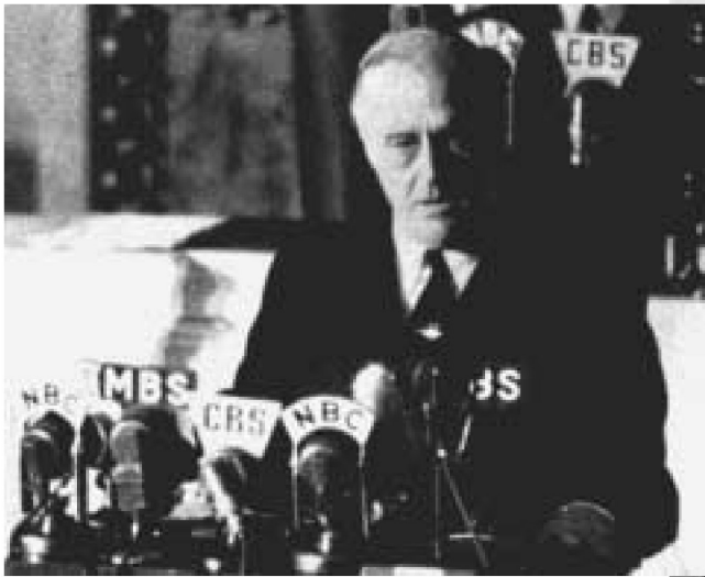
The historical model of a Presidency LaRouche discussed with the young organizers: Franklin Delano Roosevelt, who organized the “forgotten men and women” of America for a recovery program with the economic system in crisis. He used the method of in-depth explanations of economic issues, delivered over the radio (above).