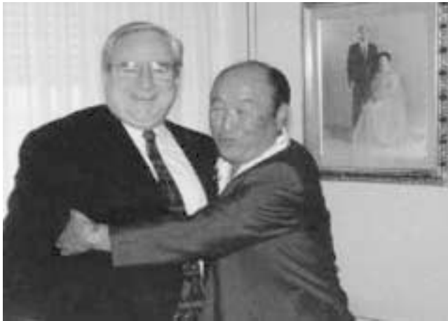
Rev. Sun Myung Moon is in the thick of the Christian Zionist networks. Here he embraces Jerry Falwell, whom he bailed out of bankruptcy.