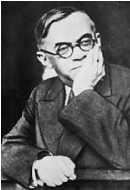
The late Israeli terrorist Vladimir Jabotinsky. Israeli Prime Minister Menachem Begin arranged for the Jabotinsky Award to be awarded to Jerry Falwell in 1980, for his "service to Israel."