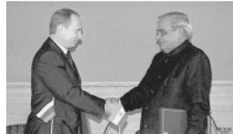
The reality of a Strategic Triangle in Asia is coming into being, to the potential benefit of all the nations of the region. Here, Russian President Vladimir Putin's Asian diplomacy in December 2002: meeting with Chinese President Jiang Zemin in Beijing (left), and with Indian Prime Minister Atal Behari Vajpayee in New Delhi.

being pushed ahead by China. The Prime Minister of India attended there. Japan and Korea depend upon this program. Japan has no future in its present form: Its banking system is hopelessly bankrupt. Japan, however, remains, in core, basically an industrial economy, which depends upon neighboring areas, to which to sell products or deliver services, in return for receiving raw materials on which Japan's existence depends.