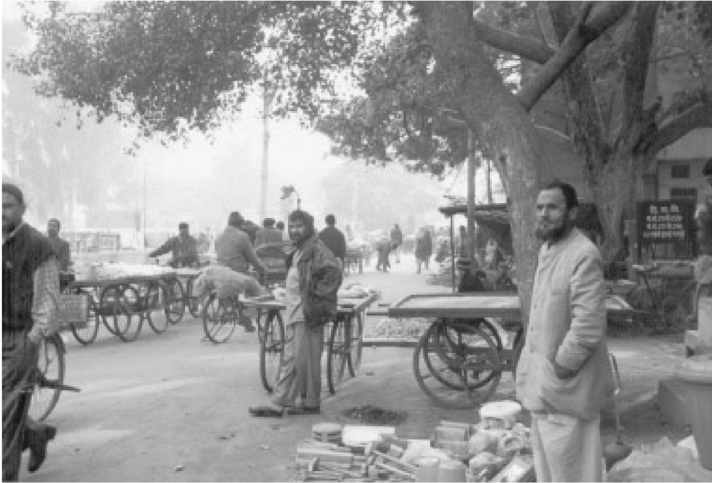
LaRouche first visited India as a U.S. soldier in 1945-46, and has had a special relationship to that nation ever since. Here, street vendors in New Delhi.

here a whole health policy, which actually improved the health of the United States, from then, until 1972-73, was a few pages! A good piece of legislation is never complicated. You get a good piece of legislation, get it through the government; adopt it; go to work on it; and then, let the experts make it work.