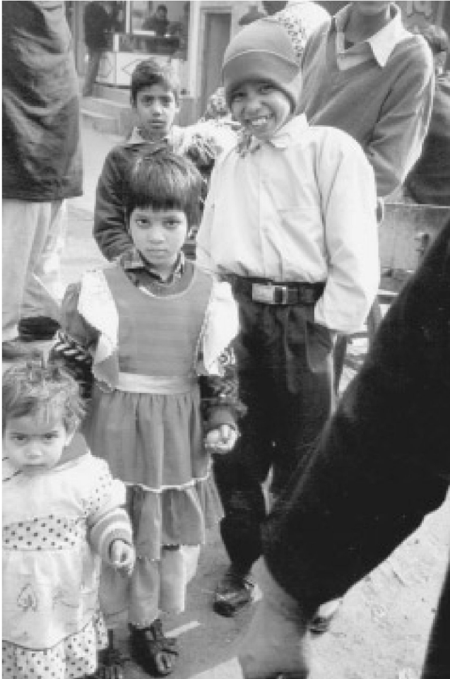
Will the world's leaders unite in a common mission, great projects for development, to build a real future for New Delhi's children, and all children?

interest exists, if the mission-orientation for it exists.