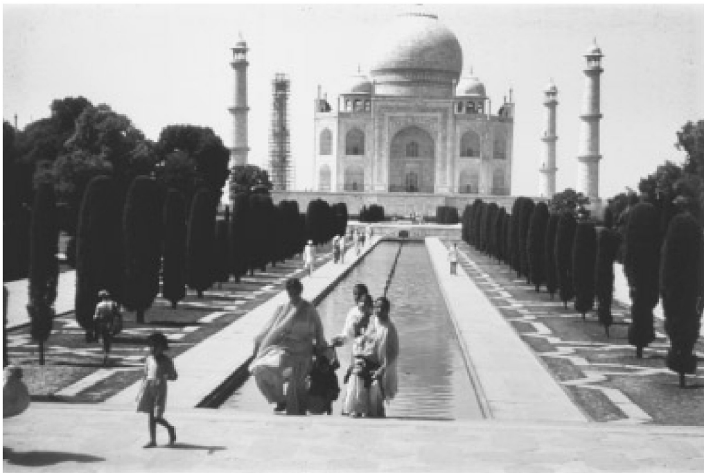
India's beautiful Taj Mahal, one of the architectural wonders of the world. "The nation-state," said LaRouche, "is the chief cause for the improvement of the condition of humanity, to the extent that it has happened, over the past 600 years."

of the international monetary-financial system are being reorganized.