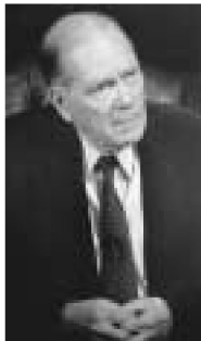
EIR Contributing Editor, Lyndon H. LaRouche, Jr.

gives subscribers online the same economic analysis that has made EIR one of the most valued publications for policymakers, and established LaRouche as the most authoritative economic forecaster in the world.