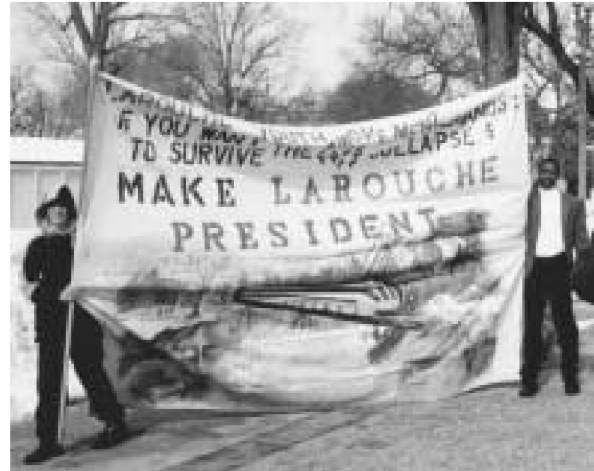
The LaRouche Youth Movement demonstrates in Washington on Feb. 19. They also conducted lobbying of Senators and Congressmen. “The youth are going to tend to turn to me; because I recognize their problem, and I demand justice, or relief from that problem. And that’s why we’re having a great impact. We’re recruiting at a rate which even astonishes me.”

of families which were connected to these money families. And they stuck her as an apprentice in the White House basement. And she had a reputation as a stalker from her high school days. And she was stuck there.