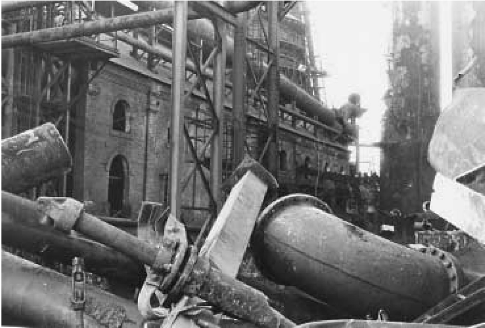
Demolition of a steel mill in McKeesport, Pennsylvania, in 1985. American populists cut their own throats by supporting free trade and deregulation, in the interest of getting a “cheaper deal.” The result: no U.S. economy!

bankruptcy, or they were about to settle the problem with Geneva Steelworks; and as it turns out, what they were talking about is a company moving in, that will buy it all out, and dismantle the steel plant to the ground, and build a “business park.”