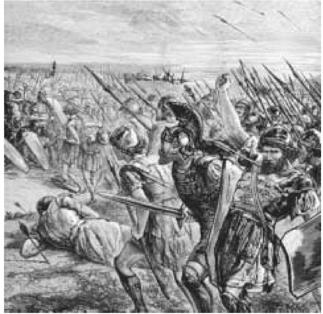
The Bush Administration is repeating the folly of ancient Athens, which launched the Peloponnesian War, thereby dooming itself. Here, the Battle of Marathon in 490 B.C., where Athens defeated the Persian army. It later tried to become the imperial superpower of that time.