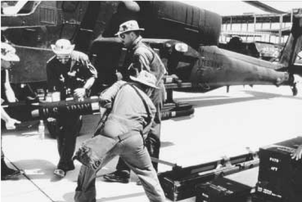
U.S. troops in Saudi Arabia, during the Gulf War of 1991. Today, the conditions are very different: The U.S. economy has collapsed, and the rest of the world has no confidence in the current U.S. leadership. “Therefore, the United States is going into a war, essentially, on its own. It’s a war which would be, probably, a trillion-dollar war, if you consider the aftermath of an attack.”

First of all, the world is in a great financial crisis. Secondly, on the hind-side of the past dozen years, the world recognizes that the past dozen years’ policy was a catastrophic failure. Therefore, anyone going back to 1990-91 now, would say, “Don’t do it.”