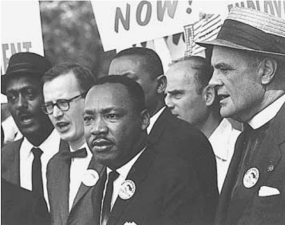
Dr. Martin Luther King during the Aug. 28, 1963 March on Washington. King's sublime leadership was a contribution to the welfare of the nation as a whole. The demand for "reparations" today represents a descent to a lower cognitive level, reflecting the failure of the civil rights leaders who succeeded King, to live up to his moral standard.

ness inside the U.S. military and other institutions, which were opposed to Roosevelt's policy on war against Hitler, and so forth. And that these people goofed. They were not enthusiastic for Roosevelt's preparations, which had started in 1936, to prepare the United States for the inevitability, at that point, of a world war launched by Hitler. And that was the issue.