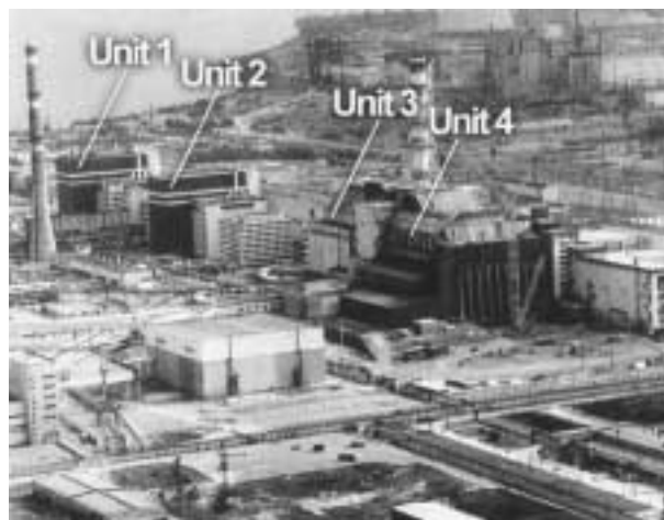
The Chernobyl nuclear reactor in Ukraine. The proliferation of radiophobic hysteria all around the world was the real “disaster.”

This is one of the most important lessons learned from the Chernobyl catastrophe, which should be taken into account in the current plans to counter nuclear and radiation terrorist attacks. Decades of promoting the LNT-based radiophobia have made the societies of devel-