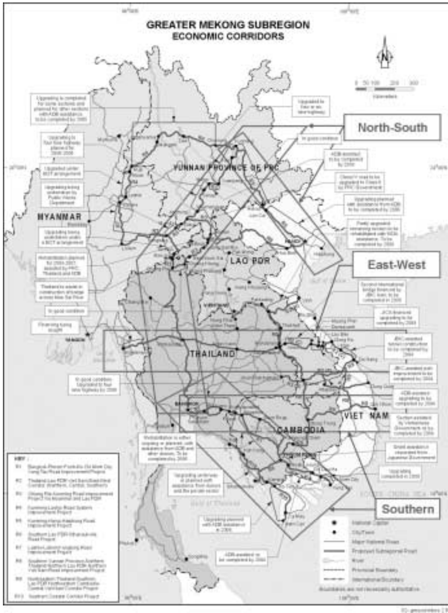
The economic development corridors of the Greater Mekong Subregion. As Japan's Foreign Minister told ASEAN this week, roads, rails, and bridges are being constructed across the two main East-West corridors. The Kunming-to-Bangkok railroad line is the major project of the main North-South corridor.