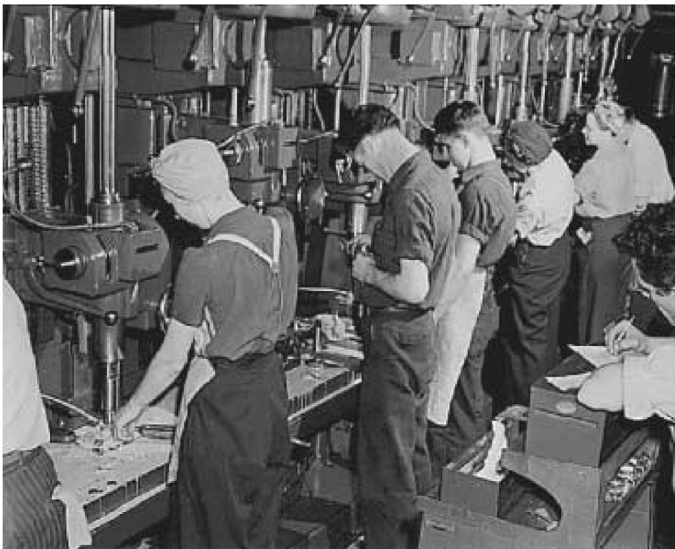
The Roosevelt era offers a model of how unskilled, uneducated people can be quickly upgraded in a national mobilization. Here, both men and women were trained to run the machines that turned out parts for America's bomber planes at a plant in Willow Run, Michigan, in 1942.

movement, but it has a purpose. I'm trying to revive the United States, and revive the world. I'm trying to reverse the Baby Boomer syndrome, of the decadence which took over the population of the United States, especially from 1964 until the recent time. Because we don't have, as you see with the leadership of industry, politics, and so forth today, these guys—we have to work with them, but I'm telling you, relative to my generation, they aren't there. They're stumblebums when it comes to managing things. And most of you who are older, know it. They're not worth much. Sometimes they try to do well, but they simply don't have the ability to judge a situation effectively, to provide good leadership.