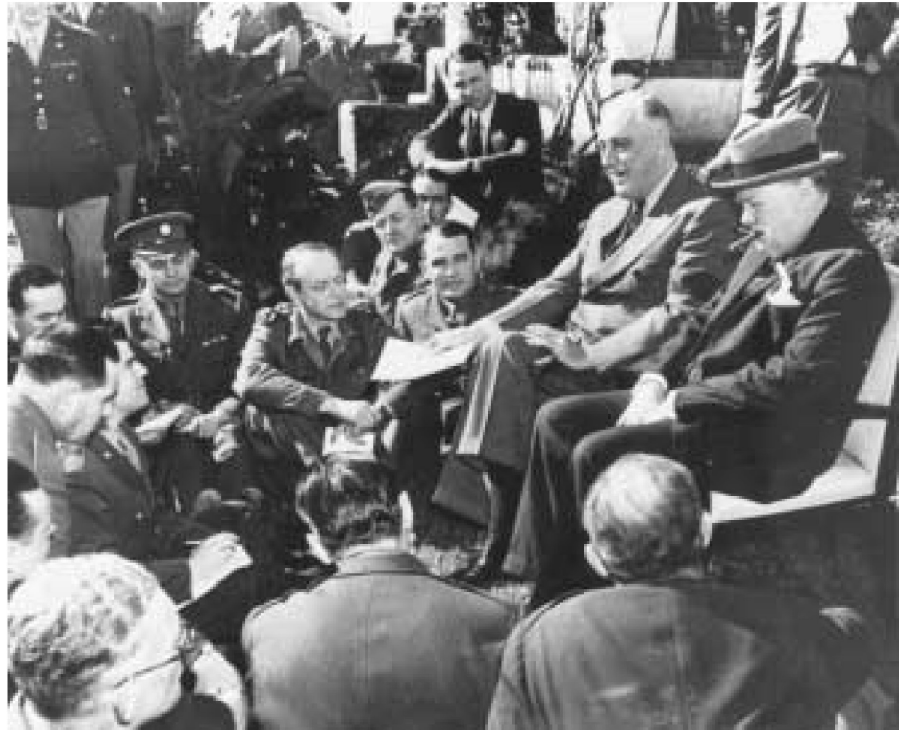
Franklin D. Roosevelt with Sir Winston Churchill at Casablanca, January 1943. Their wartime alliance was a very difficult one. Churchill saw the threat from the Synarchist/fascists, and appealed to the United States for help; but here, at Casablanca, Roosevelt told the outraged Churchill that he intended to free the colonies after the war—including Britain's colonies.