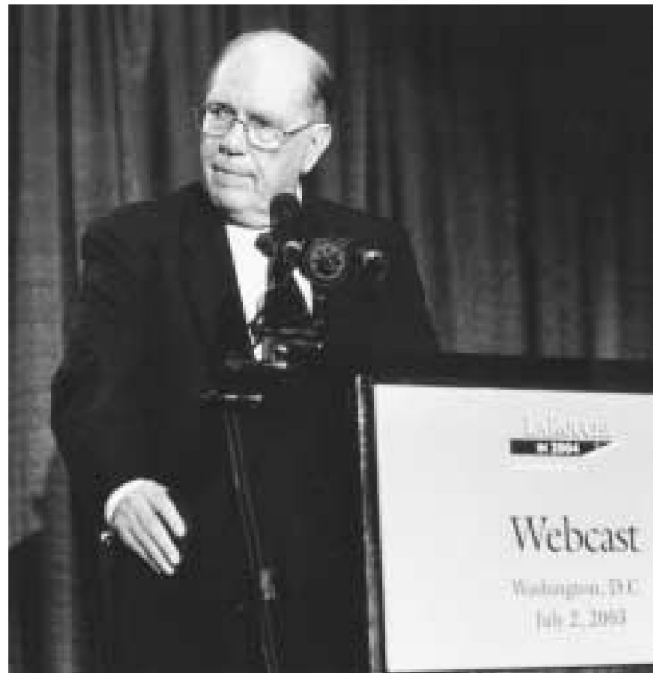
With the imminent total collapse of the present world monetary-financial system, LaRouche said, “this means we’re at a turning-point in world history, comparable to the crisis periods of the 1930s, but much more severe.” Here, the LaRouche Youth Movement campaigns in California on June 5; LaRouche delivers his webcast speech in Washington on July 2.

employment on long-term projects financed through the European Investment Bank, which will be outside the monetarist control of the European Maastricht agreements, the so-called Stability Pact agreements.