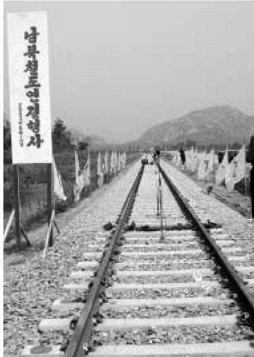
The potential for large-scale economic development of Asia is demonstrated by this historic June 15 ceremony, linking the railroads of North and South Korea for the first time since the Korean War. The chicken-hawks are trying to sabotage such moves toward reunification.

in discussion with China on one of the largest water projects in the world, the Brahmaputra power project, on the borders of Tibet and Assam.