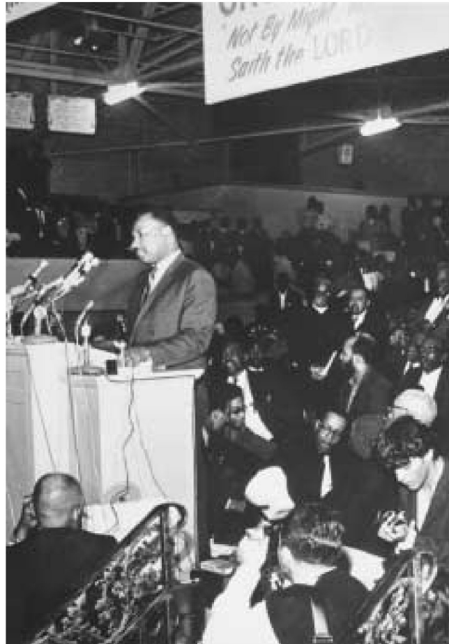
Dr. Martin Luther King, Jr. understood his life as a talent, given to him by God to spend wisely, for the benefit of all humanity. Here, he gives his “I’ve been to the mountaintop” speech on April 3, 1968.

And, we know that we have to have leaders. This is something that I would like for each and every one of us to realize: that leaders are not those that feel that, “Well, I want to be a leader tomorrow. And I’m going to lead.” God makes leaders.