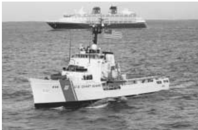
Protecting infrastructure more than building it.

Energy: Clark backs all the popularized myths, for example, on alternative energy. In his “Rural and Farm Security”