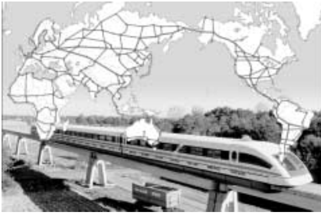
The world land-bridge, by maglev rail.

two-, three-, five-, and ten-year goals of power-generation and distribution renewal and expansion, to correct the negligence of the recent quarter century respecting systems of both generation and distribution of power; and also to meet certain associated environmental goals.”