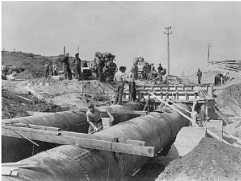
The old WPA and CCC camps as infrastructure models.

The speech states, “Two million Americans would find jobs in such enterprises as rebuilding schools, designing roads, refurbishing environmental projects and manufacturing steel for water systems. . . .” He omits any mention of railroad expansion, even for farm areas, where his web page for “Farm Policy” calls for “putting thousands to work re-