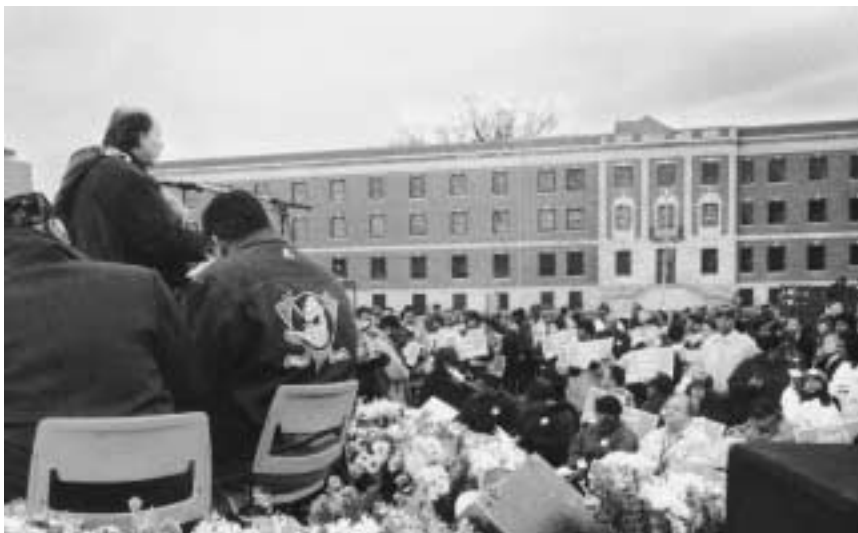
Reverse the massive loss of public hospitals—LaRouche took the lead in the fight to save Washington’s D.C. General Hospital, shown here. He would reopen it, and use the traditional Hill-Burton Act strategy to ensure quantity and types of hospital beds available in every location.