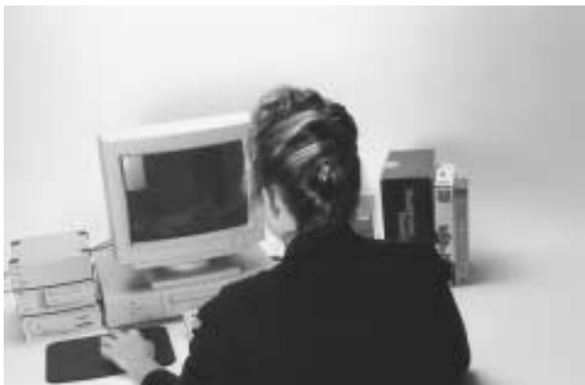
The Computer as alpha and omega of infrastructure.