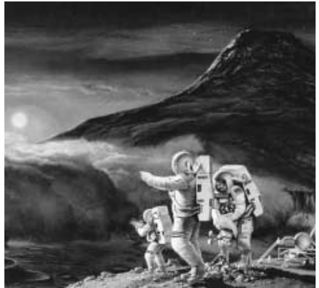
Science and infrastructure: Moon-Mars colonization mission.

On Nov. 14, 2001 , at a briefing on Capitol Hill convened by Rep. John Conyers (D-Mich.), “Public Hospitals in Crisis,” associates of LaRouche presented his views. Rep. Max-