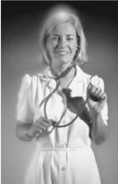
A push for more hospital nursing staff.

calls for expansion of “renewable” fuels, including wood chips, and “biorefineries” processing switchgrass, corn husks, rice straw, as well as corn-ethanol. On Aug. 1, 2003 , he stated, “I am pleased that the energy bill I voted for more than doubles the use of ethanol in gasoline and encourages energy conservation. I have long supported increasing our commitment to renewables. . . .”