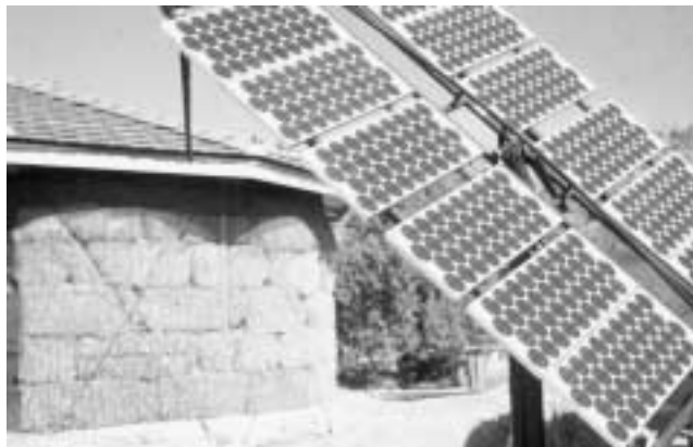
Solar power as infrastructure.

The Space Program: On Nov. 23, 2003 , in a Q&A with the Concord Monitor /WashingtonPost.com on line, Dean said, “I am a strong supporter of NASA and every government program that furthers scientific research. I don’t think we should close the shuttle program but I do believe that we should aggressively begin a program to have manned flights to Mars. This, of course, assumes that we can change Presidents so we can have a balanced budget again.”