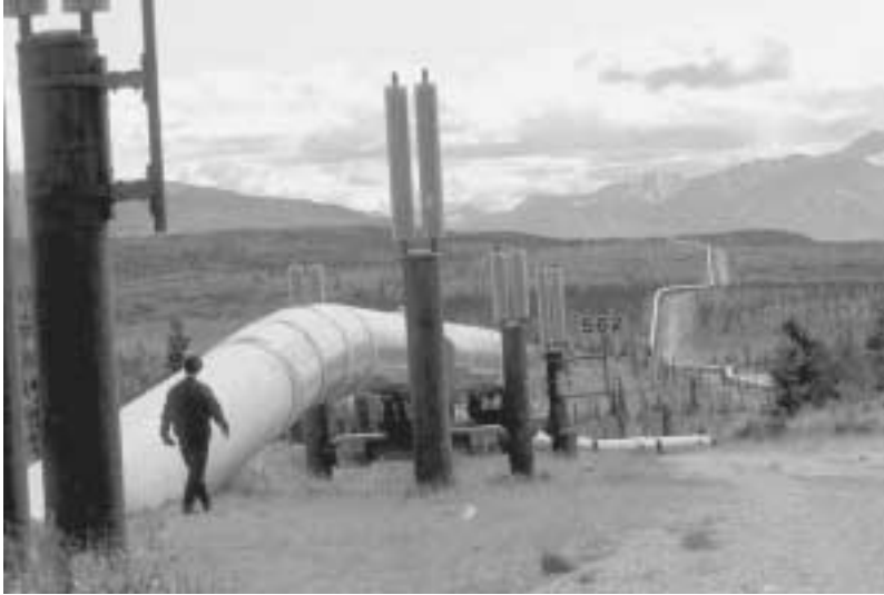
Pipeline to Alaska.