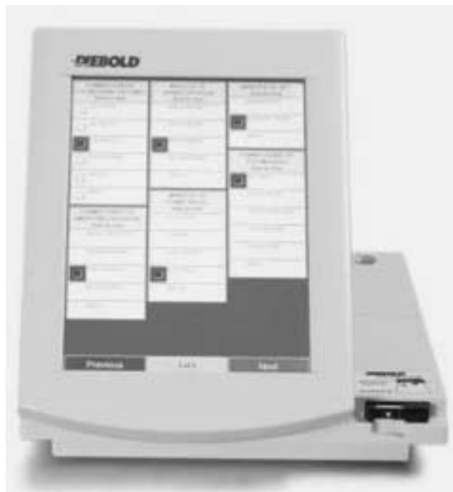
Monster of many horror stories: a Diebold computer touch-screen voting computer. Let the disasters described here be instigated nationally, and a coup against representative government will occur.